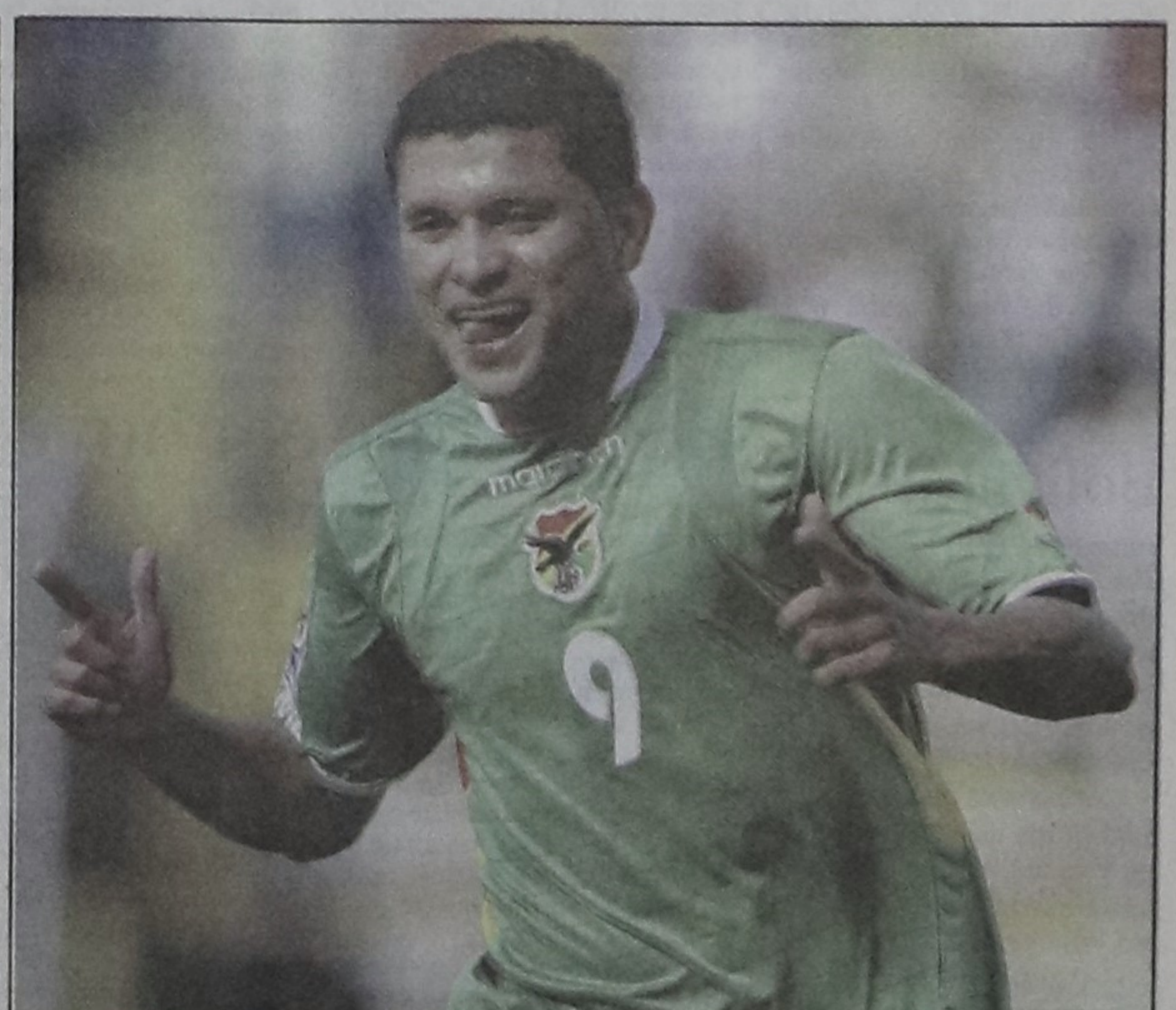
CAN'T TAKE IT ANYMORE! Argentina coach Diego Maradona (L) scratches his forehead after seeing his side thrashed 6-1 by Bolivia in their World Cup qualifier while the winners' hat-trick star Joaquin Botero (R) goes on a celebration lap at the Hernando Siles Stadium in La Paz on Wednesday.