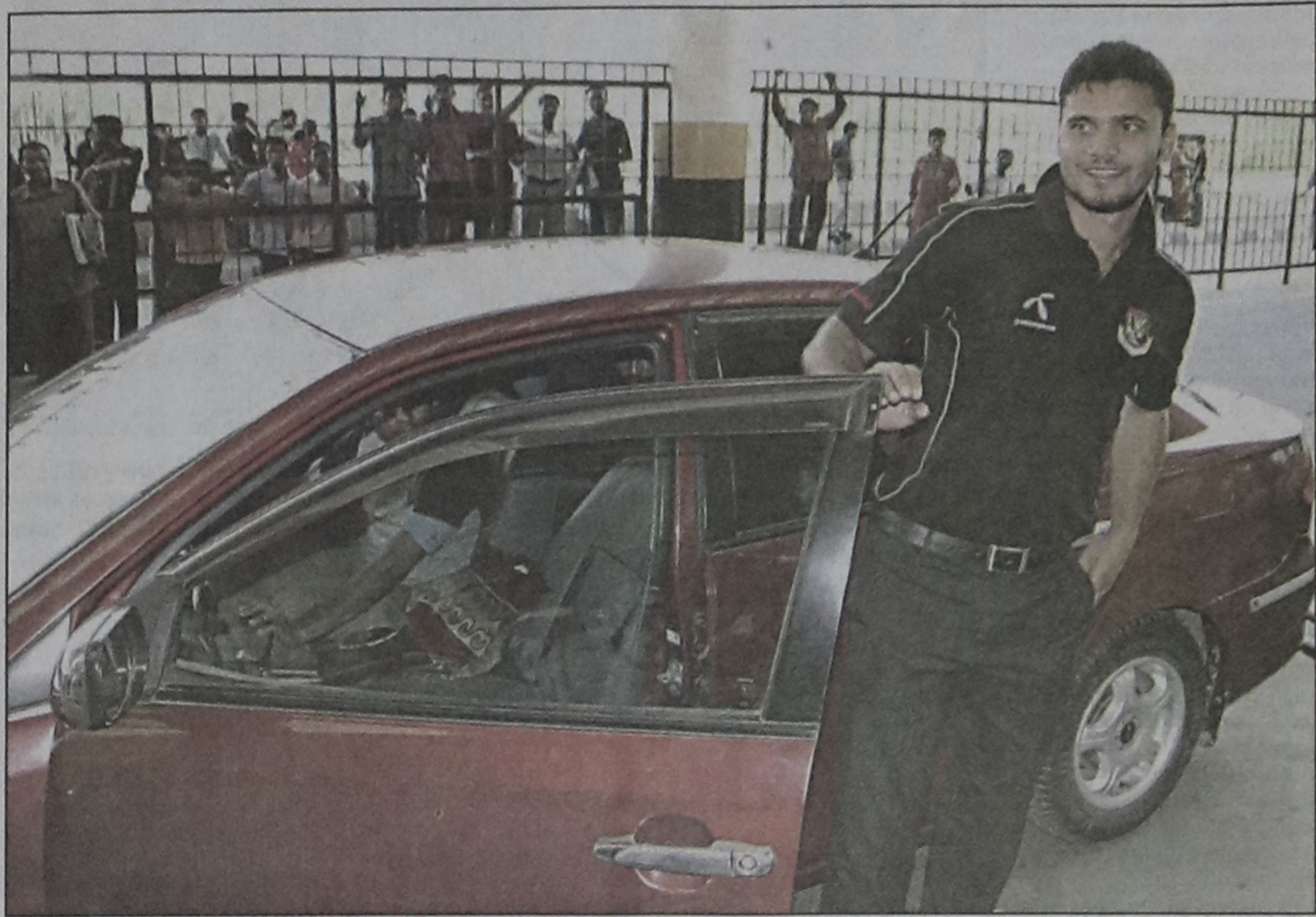
SIX-LAKH DOLLAR MAN: Cricket superstar Mashrafe Bin Mortaza arrives at the Zia International Airport to leave for India yesterday. He left for Kolkata to play for the Shah Rukh Khan-owned Knight Riders in the upcoming Indian Premier League.