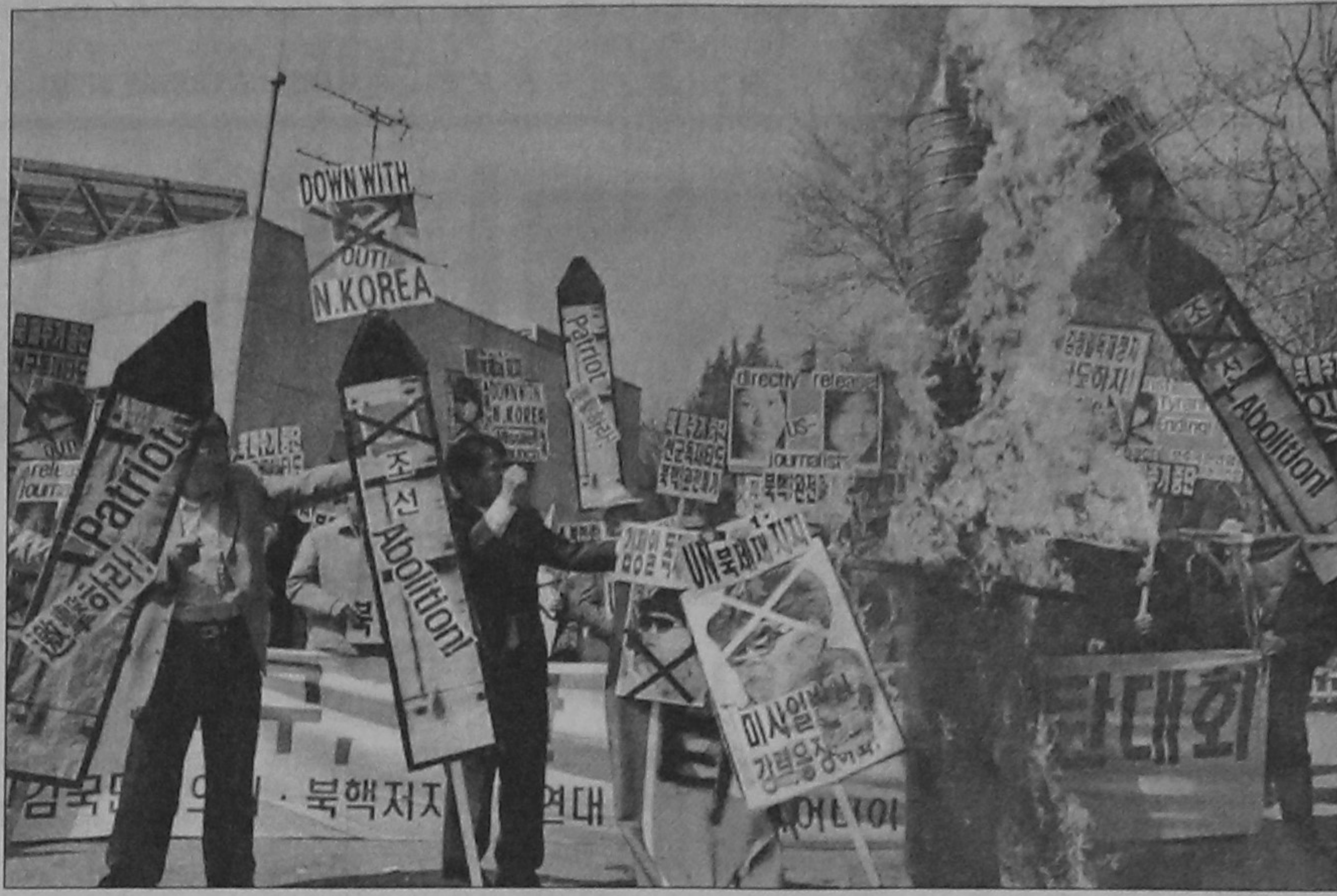
Conservative activists are burning a paper missile during a rally by about 100 people in Seoul yesterday. About 100 activists called for strong UN sanctions over North Korea's rocket launch and urged the international community to cut aid to the hardline communist country.

The Tamil Tiger rebels have fought since 1983 to create an independent homeland for ethnic minority Tamils, who have faced decades of marginalisation by successive governments controlled by ethnic Sinhalese. More than 70,000 people have been killed in the violence.