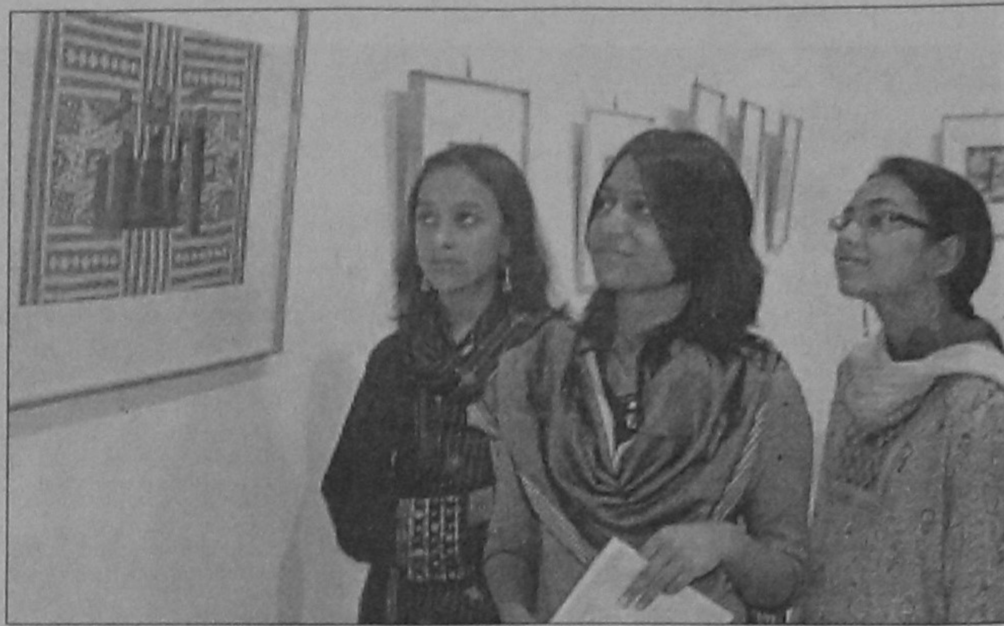
Visitors at a calligraphy exhibition that began at Shilpakala Academy gallery in the city yesterday. The Shilpakala Academy organised the weeklong exhibition.