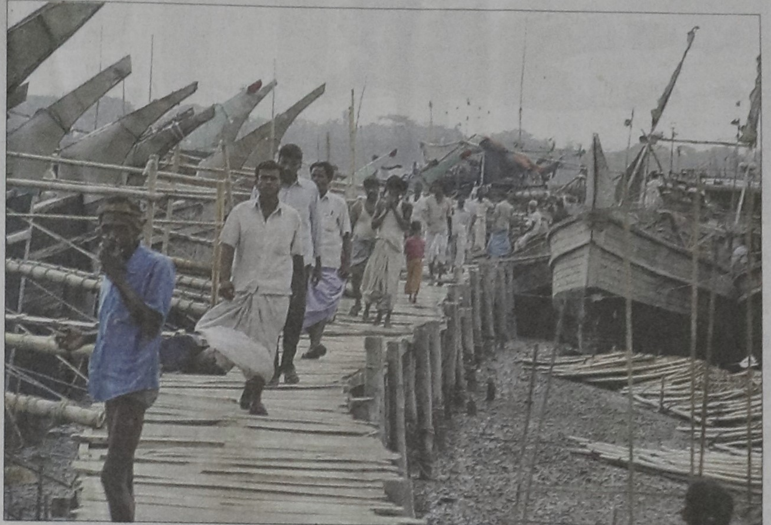
The unplanned jetties and gangways along different points of the river Karnaphuli pose a threat to the navigability of Chittagong port channel. The picture was taken from Fishery Ghat area.

However, the rent for the slipway would be at the same rate as charged for jetty, ranges from Tk 1500 per foot to Tk 3000 per foot depending on the size, Bashar said.