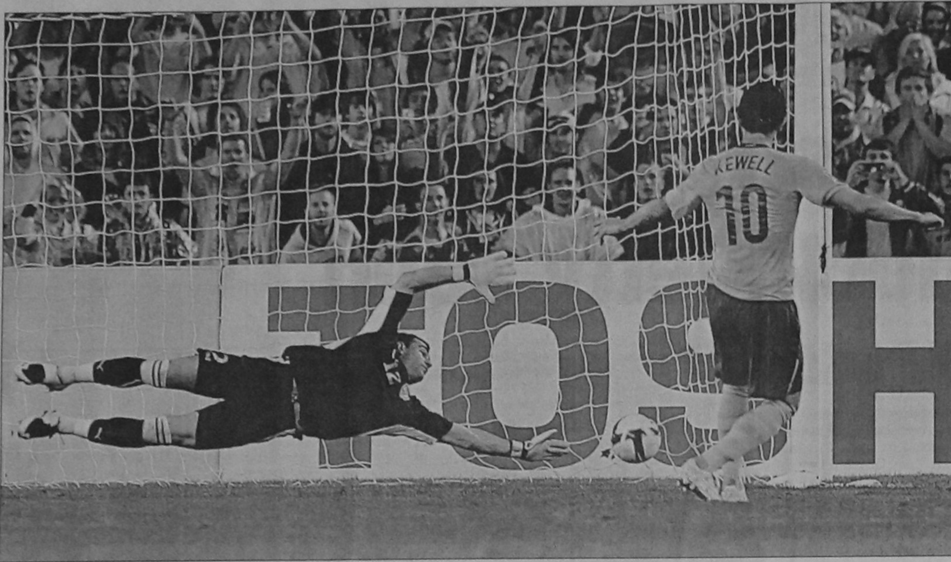
Australia star Harry Kewell (R) converts a penalty to make it 2-0 against Uzbekistan during their 2010 World Cup qualifier in Sydney on Wednesday.