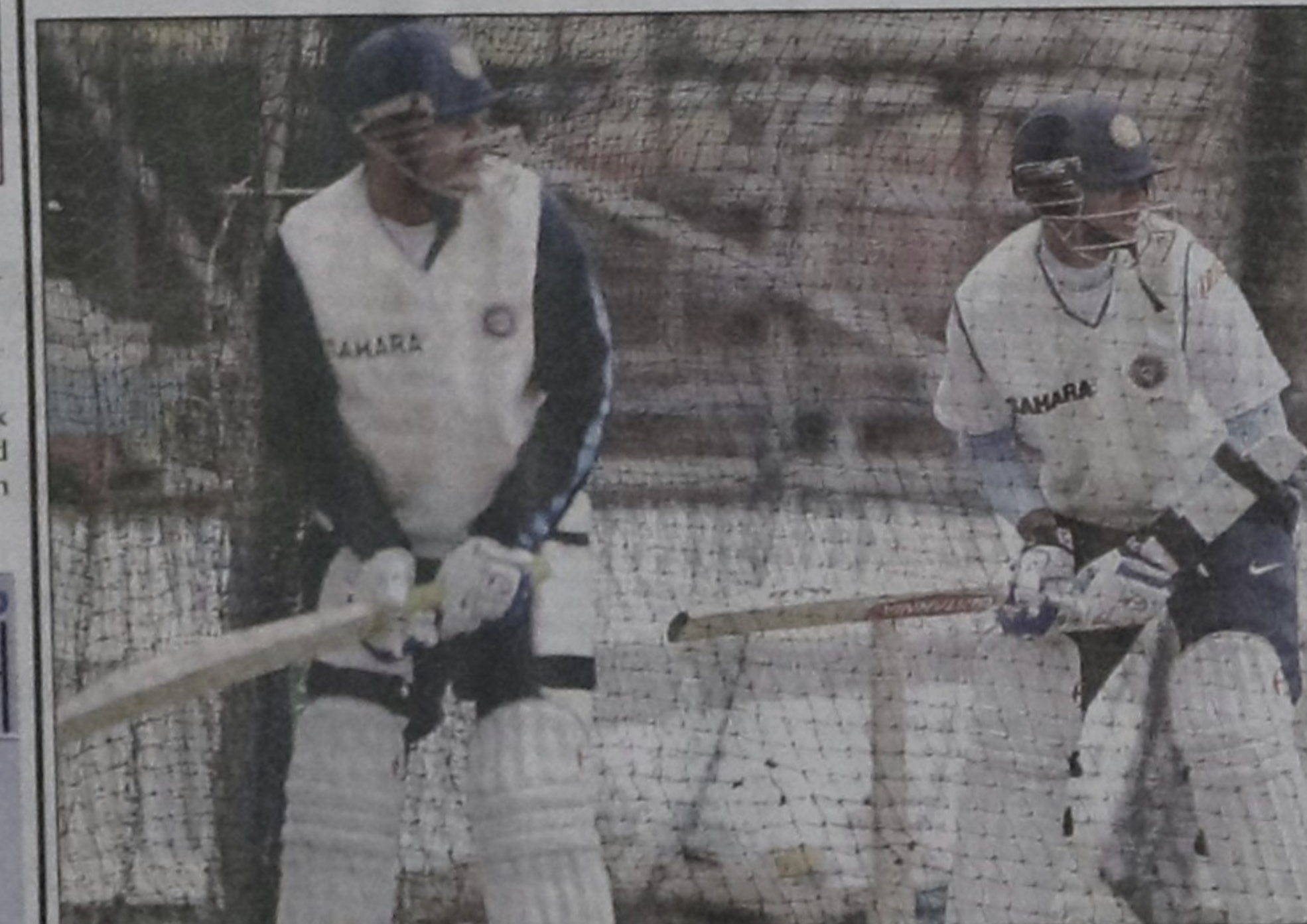
NEED A BIG ONE: India opener Virender Sehwag (L) and Rahul Dravid bat in the nets during a practice session at the Basin Reserve in Wellington yesterday. Sehwag will be looking for a handsome score in the third and final Test starting here on Friday. In the first two matches he managed only 24, 34 and 22.