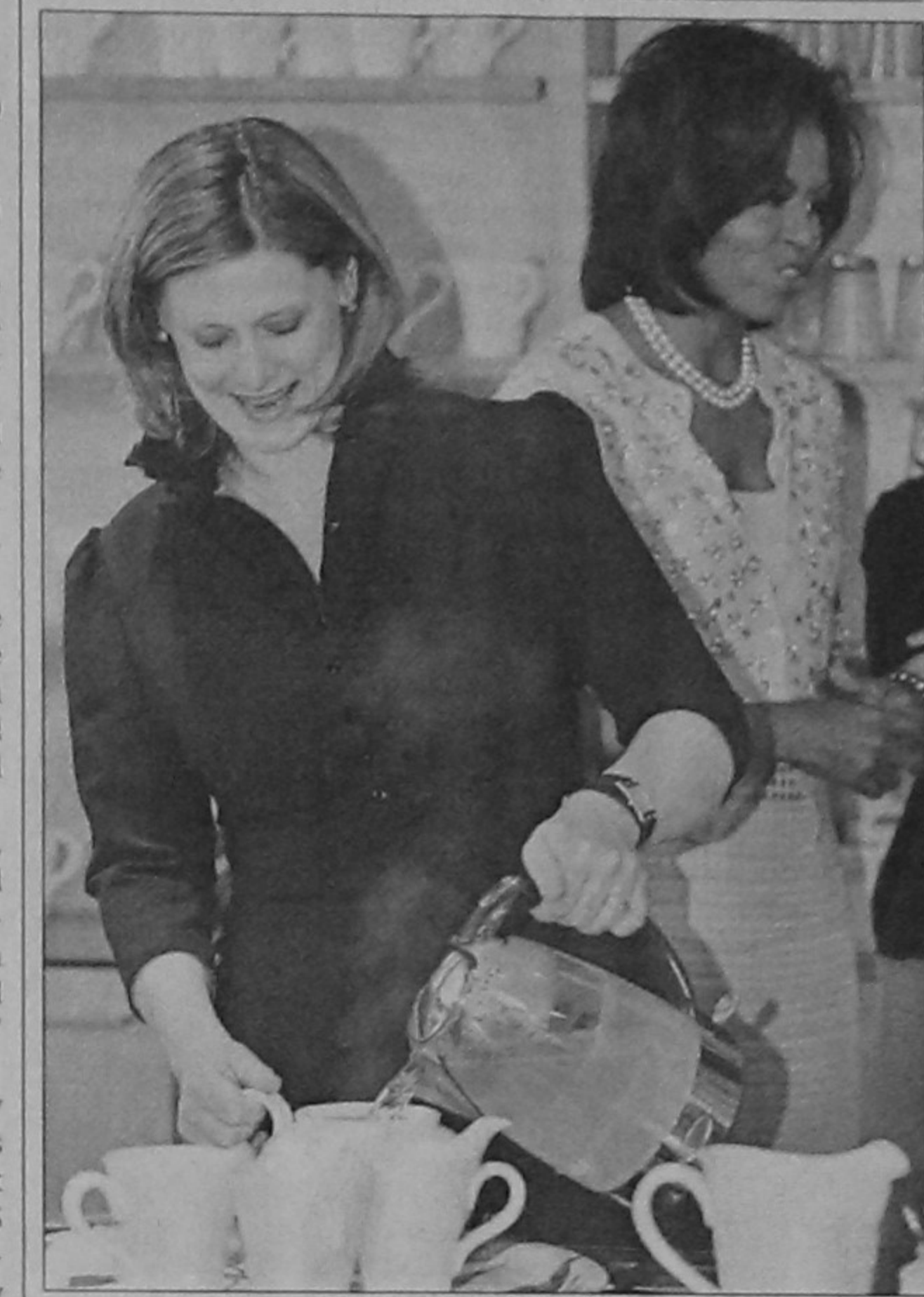
Sarah Brown, (L) wife of British Prime Minister Gordon Brown, pours a pot of tea as she visits Maggie's Cancer Caring Centre in west London yesterday with US First Lady Michelle Obama (R). US President Barack Obama and British Prime Minister Gordon Brown held talks at Downing Street Wednesday on the eve of a crucial G20 summit in London aimed at fixing the global economy.

"Without reforms first... our participation would only grant legitimacy to the biased actions of a fundamentally illegitimate body."