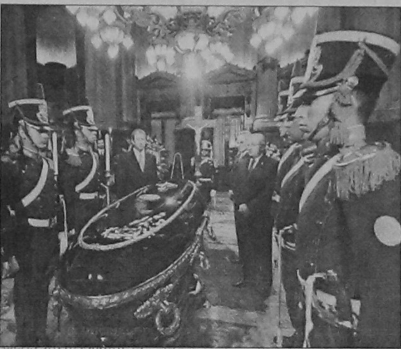
shows members of the Granaderos battalion escorting the coffin with the remains of Argentina's ex-president Raul Alfonsin (1983-1989) during his wake at the Salon Azul of the national Congress building in Buenos Aires yesterday. Alfonsin, who oversaw the country's return to democracy after the bloody 1976-1983 military dictatorship, has died from cancer at the age of 82.

"The American administration should pressure the Netanyahu government to stick to the fundamentals of the peace process, in other words land for peace."