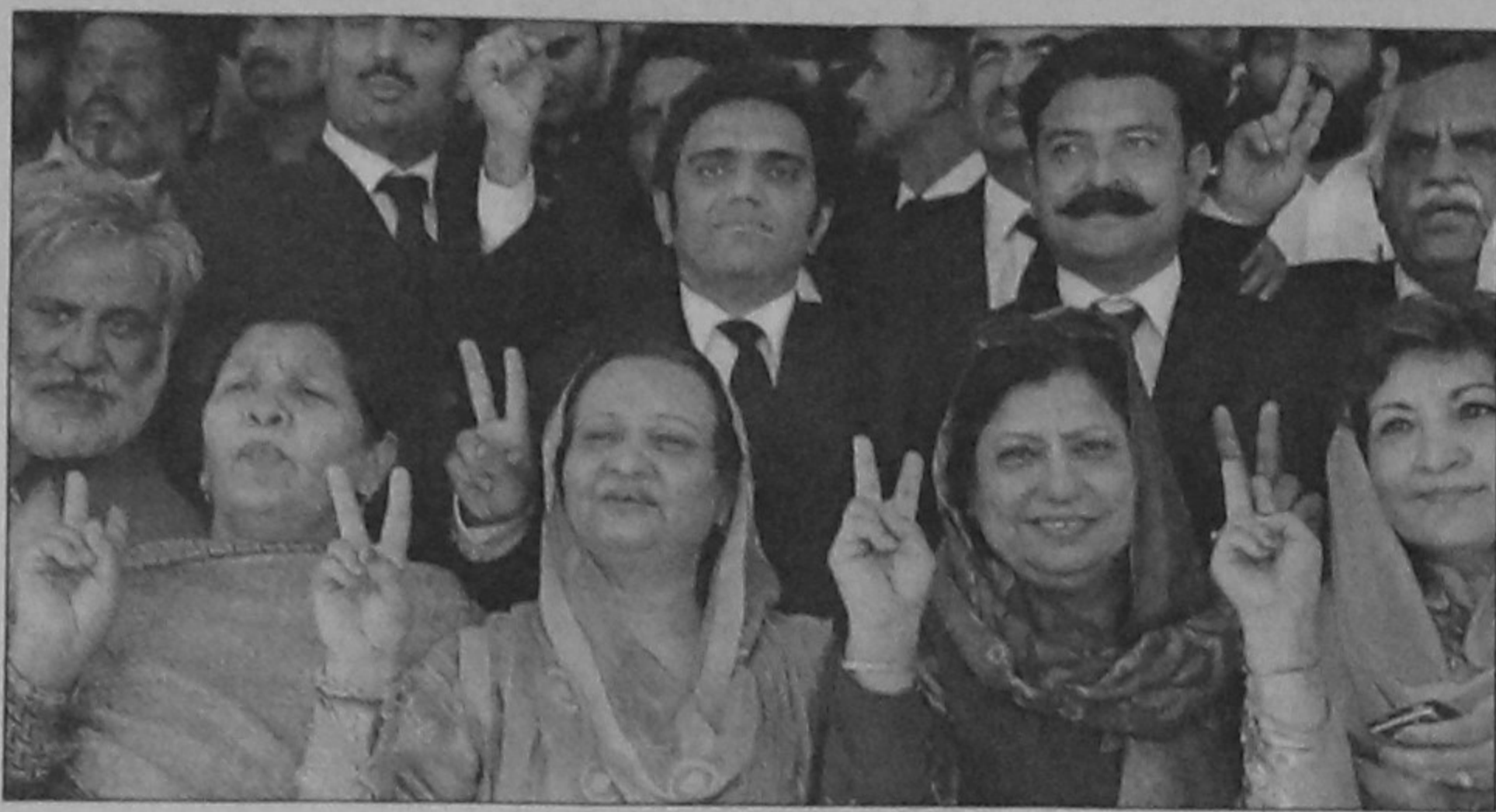
Supporters of Pakistan Muslim League-Nawaz pose as they celebrate a court decision outside the Supreme Court building in Islamabad yesterday. Pakistan suspended a court ban on opposition leader Nawaz Sharif and reinstated his party's government in a key province, in a move likely to ease political tensions in the troubled country.