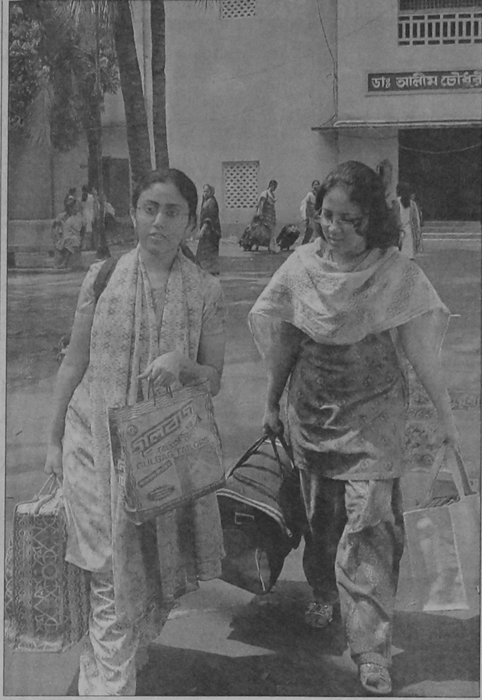
Students of Dhaka Medical College leave their dormitories yesterday after the authorities ask them to vacate the hostels following a factional clash of Bangladesh Chhatra League (BCL) on the college campus. (Story on Page 1)