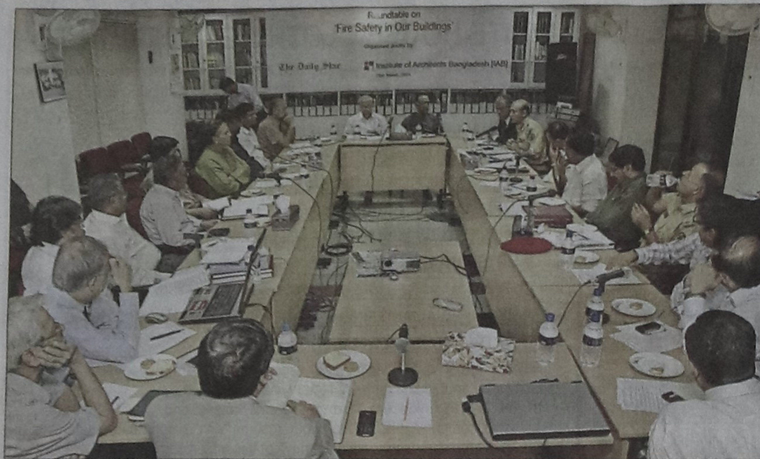
The Institute of Architects Bangladesh (IAB) and The Daily Star organise a roundtable on "Fire Safety in Our Buildings" at The Daily Star conference room yesterday. (Story on Page 1)