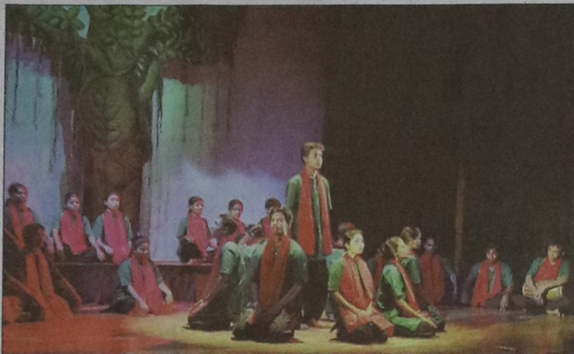
Bodhan Abritty Parishad stage "Ekho Ekattor" at TIC auditorium.

At a time when the nation has raised its voice for the trial of war criminals and collaborators in the Liberation War of 1971, Bodhan Abritty Parishad staged its second production of a poetic play "Ekho Ekattor". Even the post-liberation younger generation of the country, brought up on the staple of historic distortion and disinterest in the era of the Liberation War, have expressed their interest in learning about our glorious past. A repeat presentation of the valiant struggle of the freedom loving people and the role of the evil anti-liberation force is therefore immensely needed. And "Ekho Ekattor" is truly contemporary from this viewpoint. Bodhan staged the play for the second time on Saturday at the Theatre Institute Chittagong (TIC) while it was at first staged on December 18 last year.