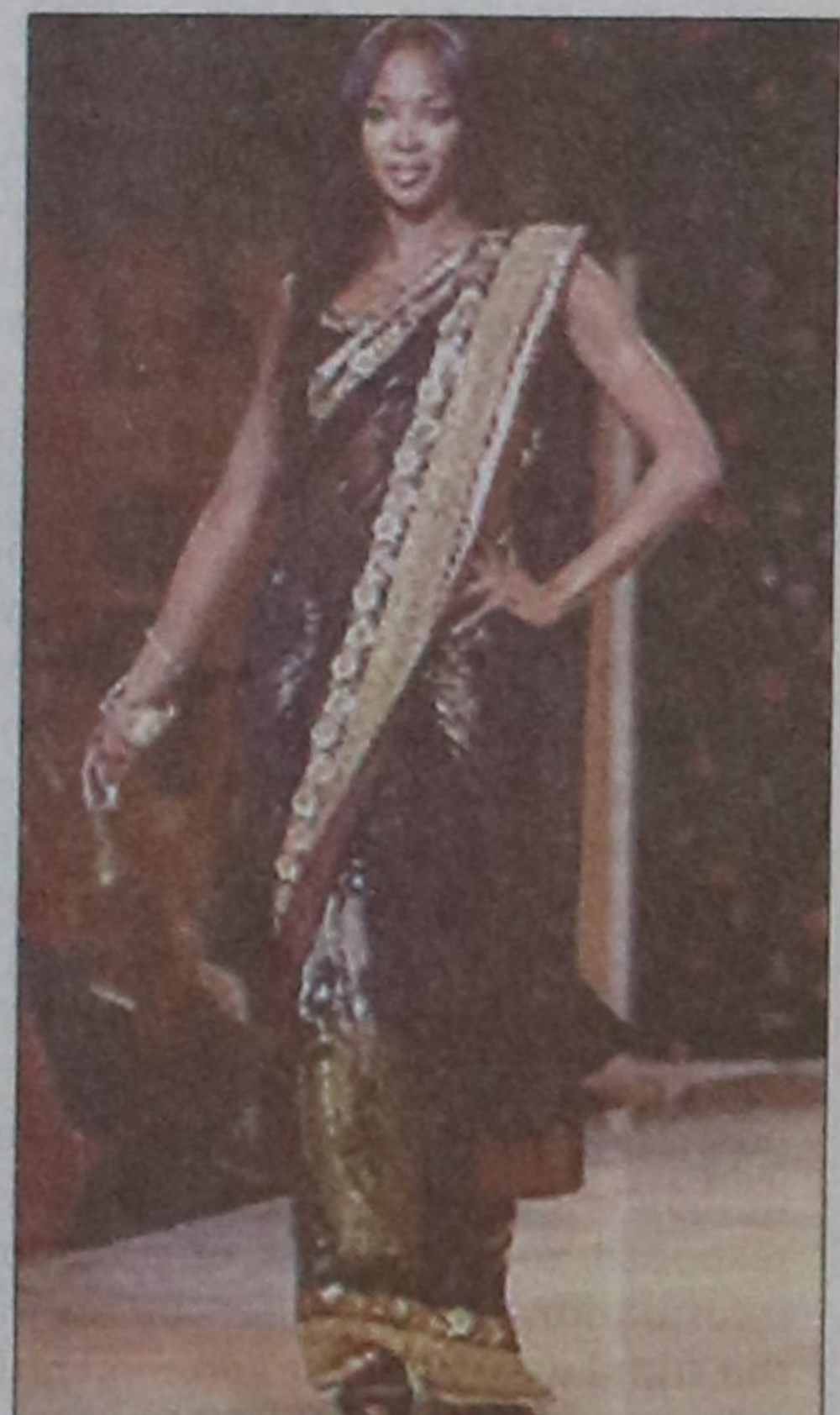
Campbell sporting a black saree, walks the ramp.

beset by controversies but is one who has never hesitated to chip in when it comes to contribute to a noble cause. Remember, she raised money for victims of Hurricane Katrina in the US in 2005 and again for British flood victims two years later?