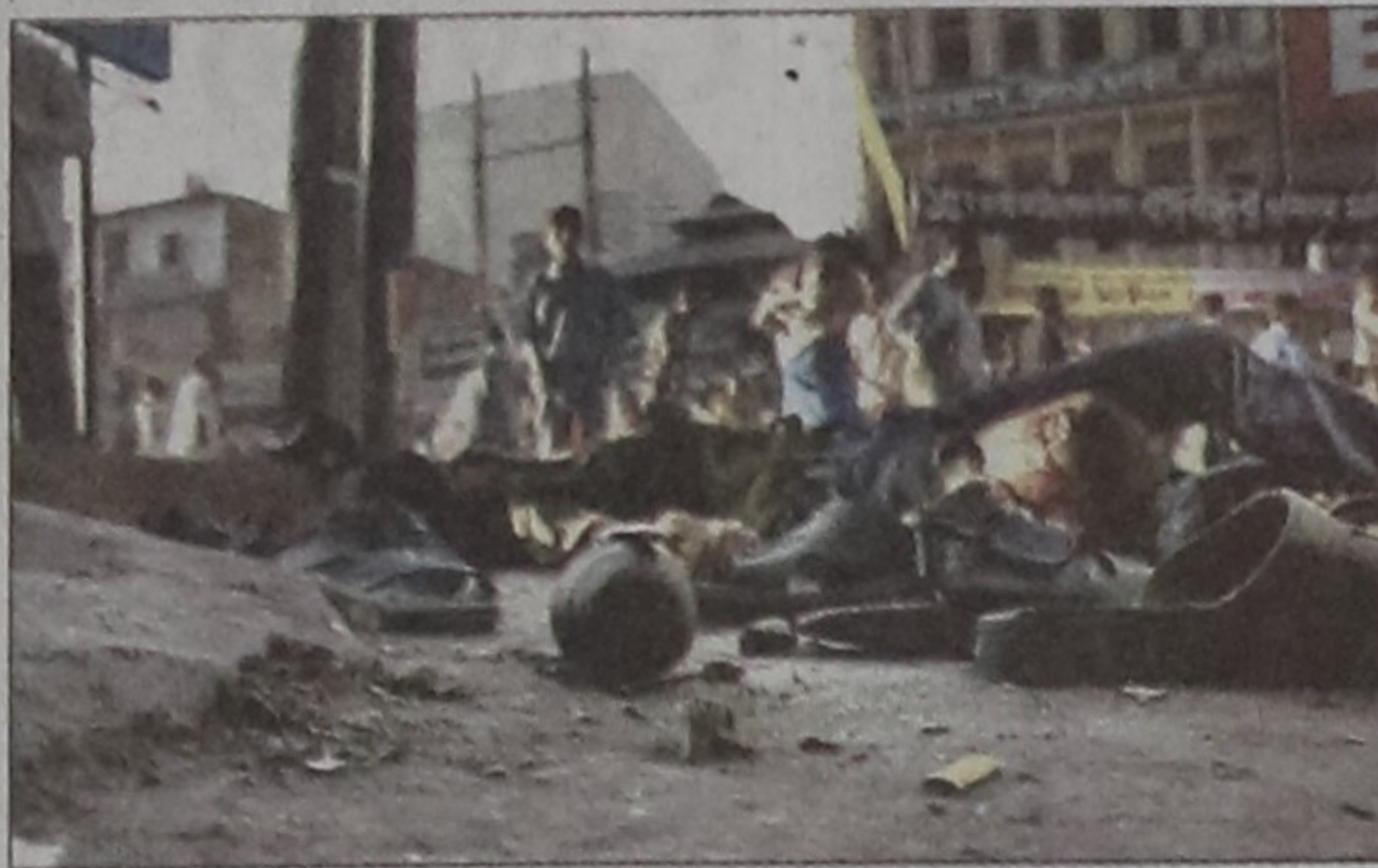
This file photo shows one of the victims of the August 21 carnage, lying at Bangabandhu Avenue in Dhaka a few minutes after the grisly attack.