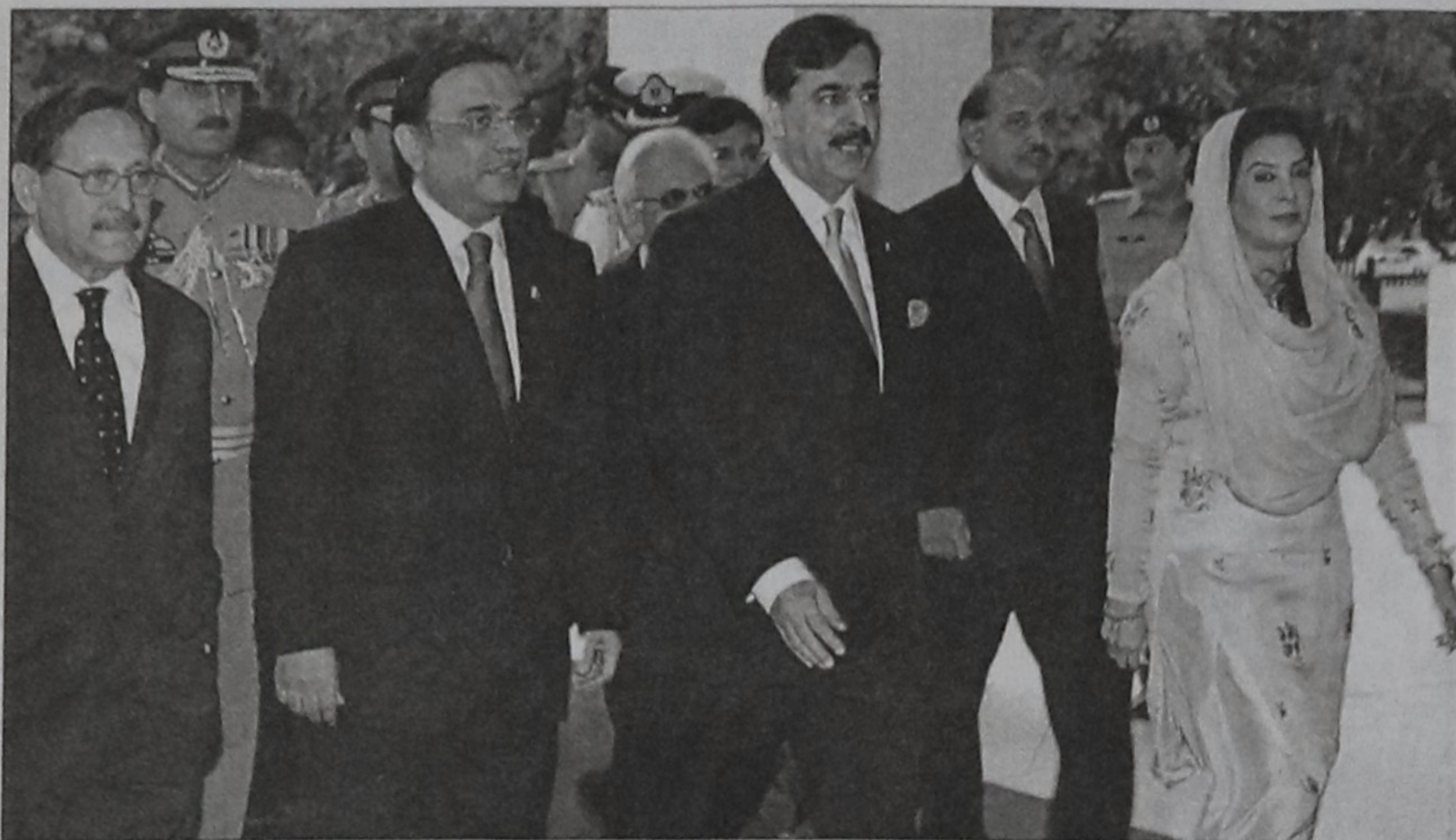
Handout photo shows Pakistani Prime Minister Yousuf Raza Gilani (3R), Chairman of Senate Farooq Naek (L) and Speaker of the National Assembly Fahmida Mirza (R) as they walk with President Asif Ali Zardari (2L) on his arrival to address the joint session of the parliament in Islamabad on Saturday.