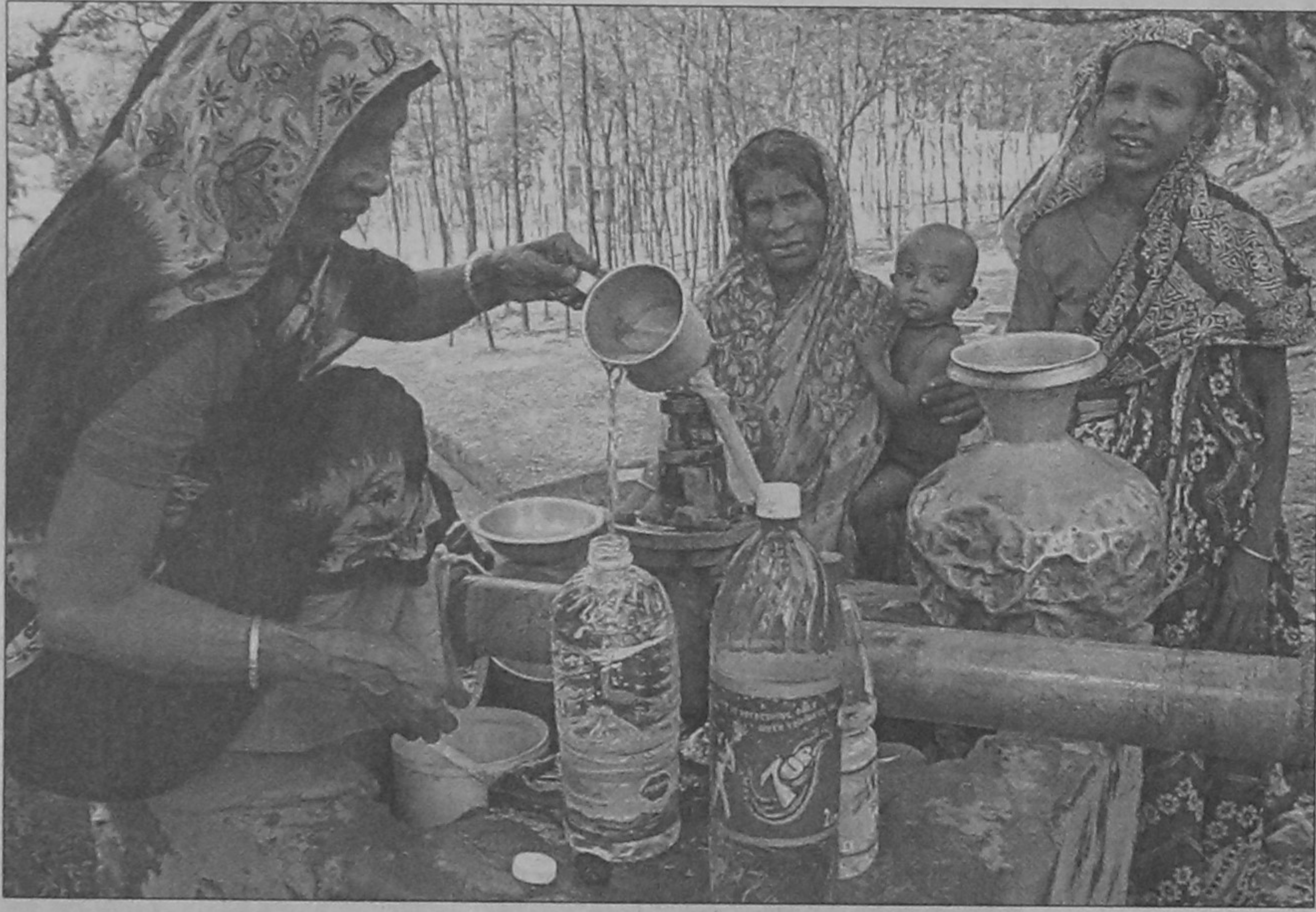
A woman fills her bottles with water percolating through the joint of a water pipeline in the CRB area in the port city yesterday as the city dwellers are suffering from acute water shortage accompanied by frequent power outage.

Dr Wajed, who was suffering from kidney and cardiac complications, left for Singapore last week and underwent treatment at Singapore's General and Heart Centre (SingHeart Hospital).