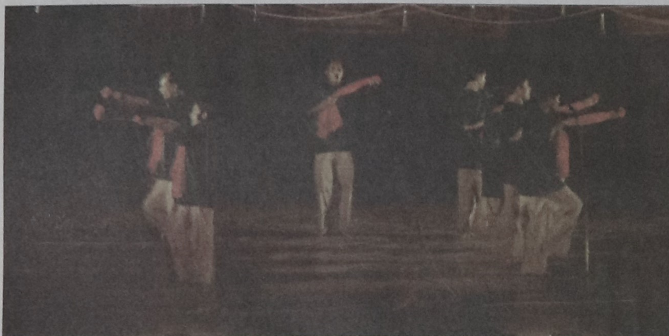
Life's realities portrayed through theatre.

Two-day festival at Rabindra Sarobar by Nijera Kori