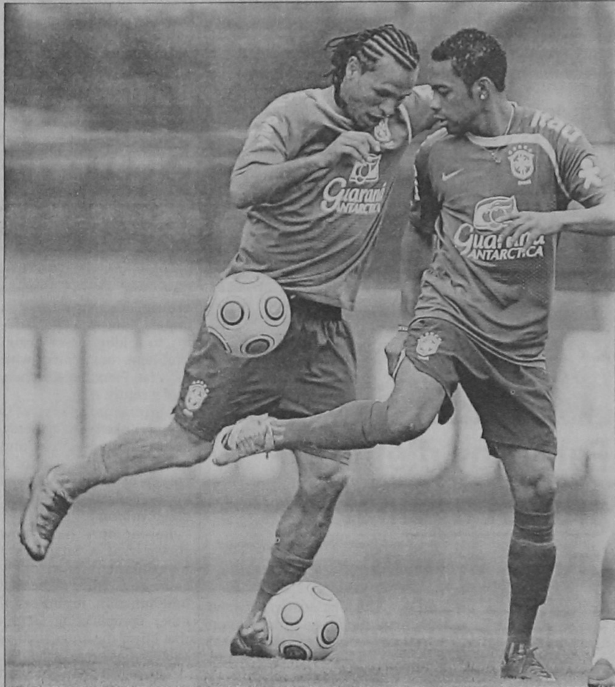
Brazil strikers Robinho (R) and Luis Fabiano practice during a training session in Teresopolis on Thursday.