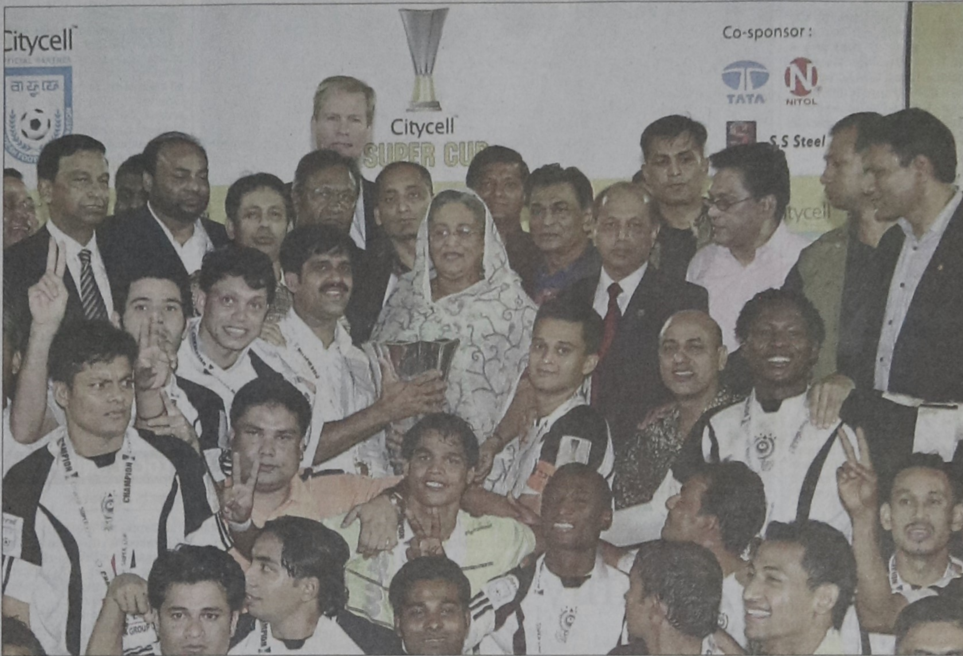
WE ARE THE CHAMPIONS: Mohammedan players and club officials celebrate with the Super Cup after receiving the trophy from Prime Minister Sheikh Hasina following yesterday's final at the Bangabandhu National Stadium.