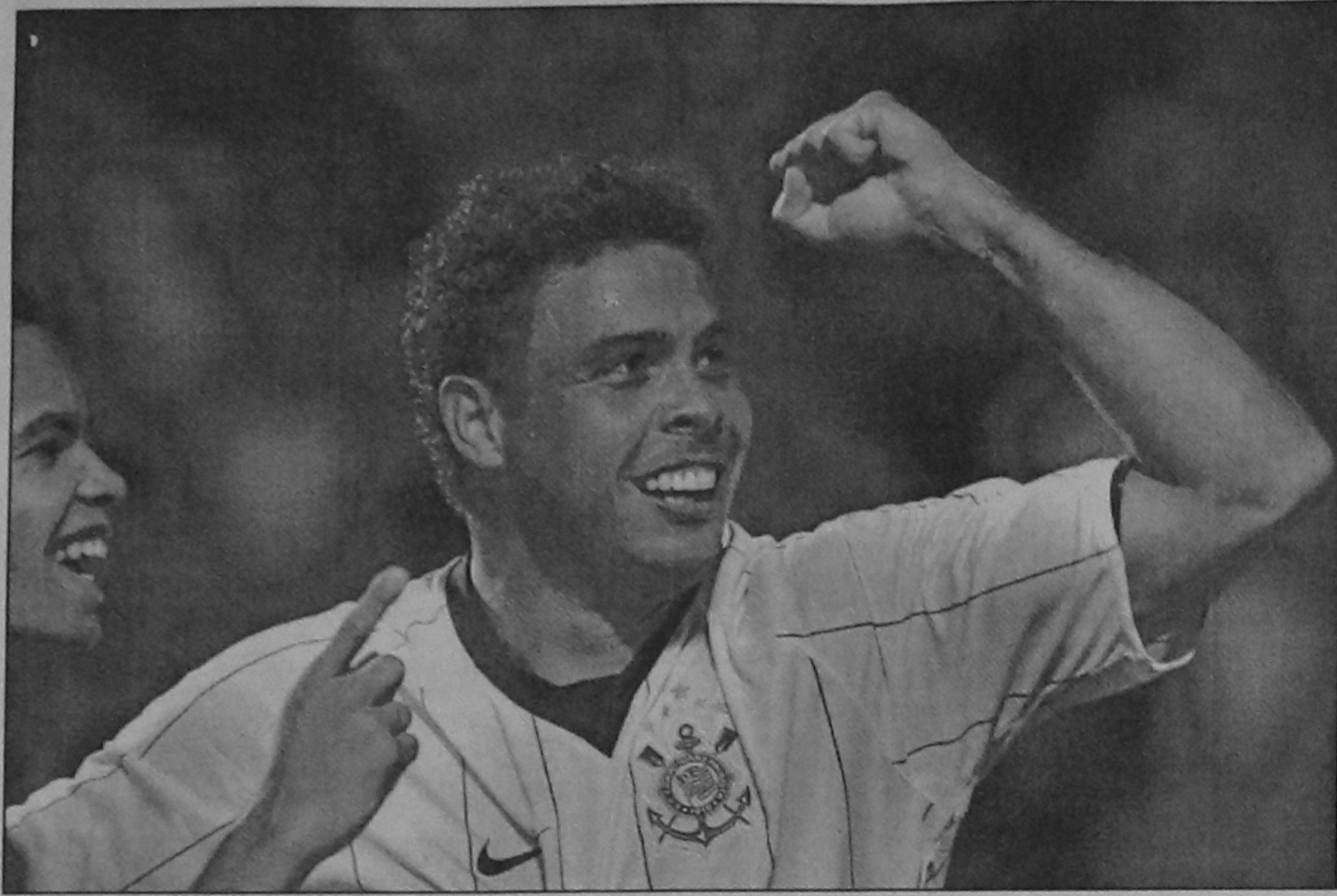
Brazil superstar Ronaldo (R) of Corinthians celebrates scoring his second goal against Ponte Preta during their Paulista Championship encounter at the Pacaembu Stadium in Sao Paulo on Wednesday.