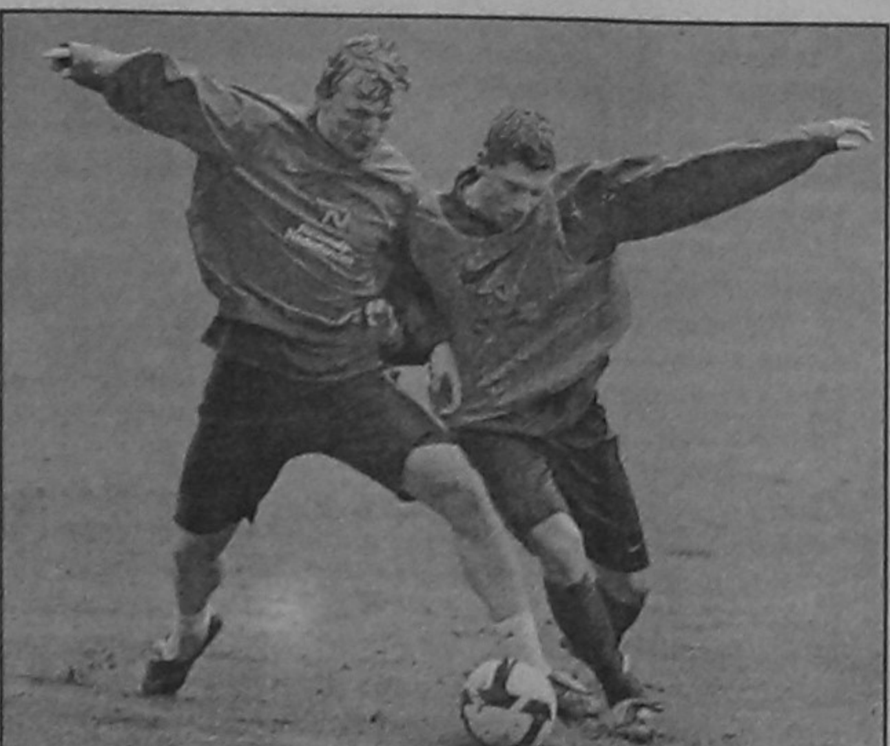
Dutch forward Dirk Kuyt (L) fights for the ball with teammate Stijn Schaars during a training session in Katwijk on Wednesday.

Juve are currently trailing Inter Milan by seven points in Serie A with only nine games remaining. Following their elimination from the Champions League by Chelsea earlier this month, club coach Claudio Ranieri said they needed bigger stars to compete for the top honours.