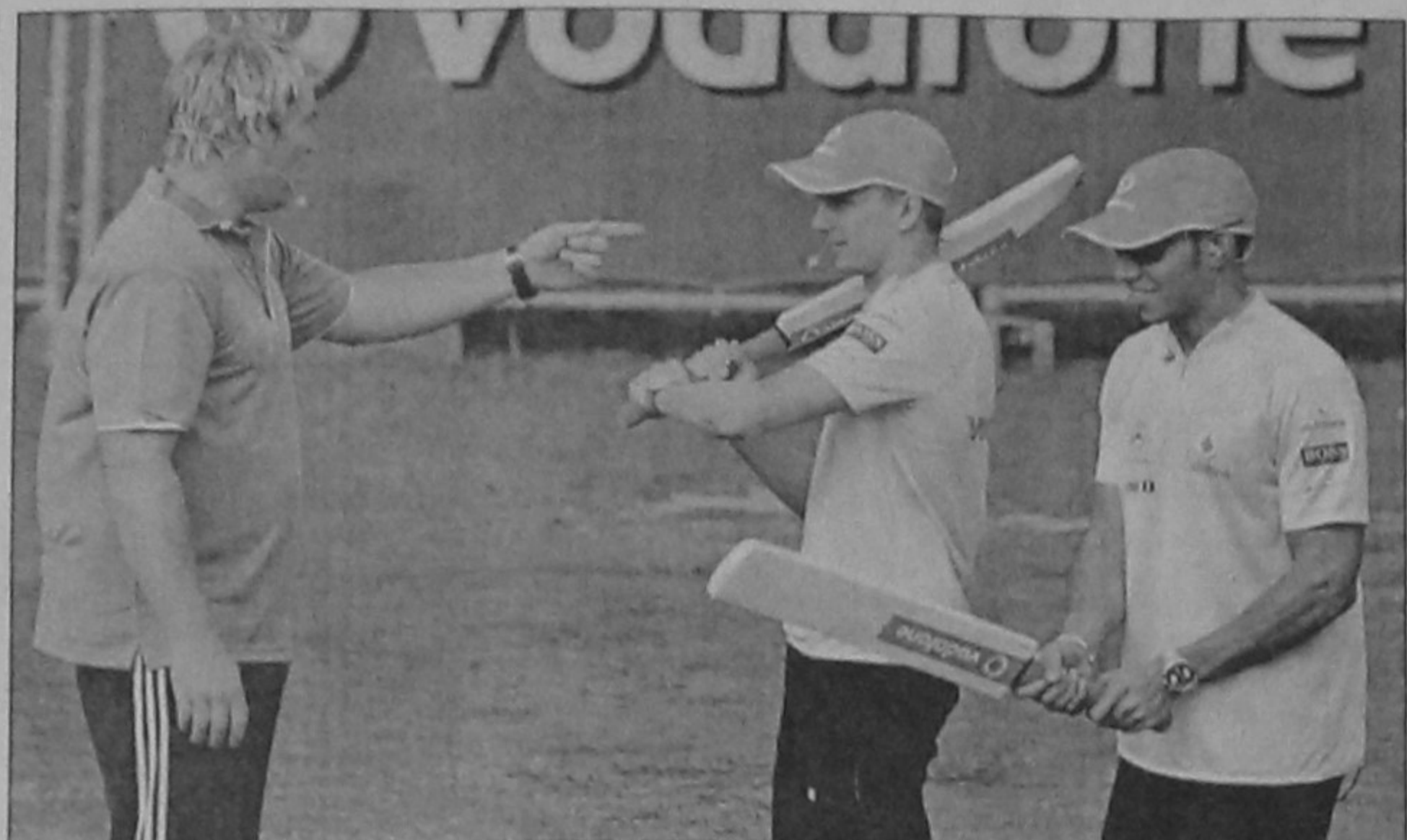
McLaren drivers Heikki Kovalainen of Finland (C) and Lewis Hamilton of Great Britain (R) receive coaching tips from Australian cricket great Shane Warne (L) at a promotional event in Melbourne yesterday. Formula One teams and drivers are arriving for the first Grand Prix of the season, the Australian Grand Prix, to be held March 29.

The 1932 Olympics in Los Angeles was the first time the three-level winner's stand was used for the medal ceremony.