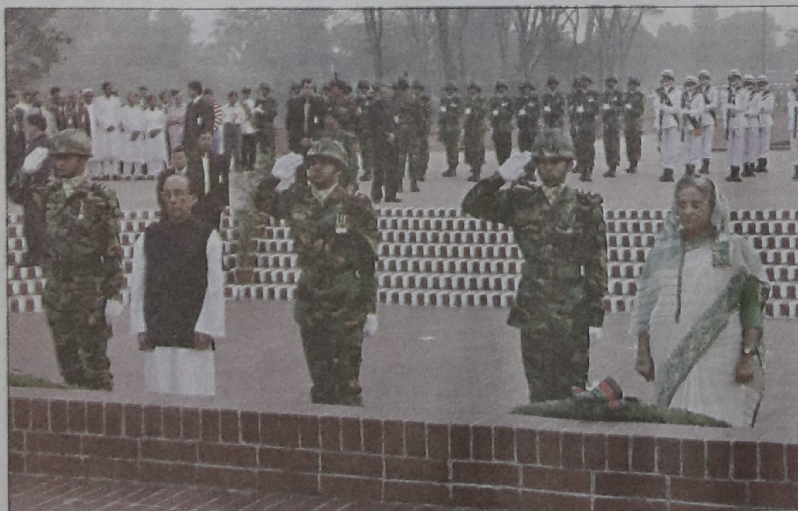
The National Memorial at Savar is bathed in floral tributes as the nation paid homage to the martyrs of the Liberation War yesterday marking the 39th Independence Day of the country.