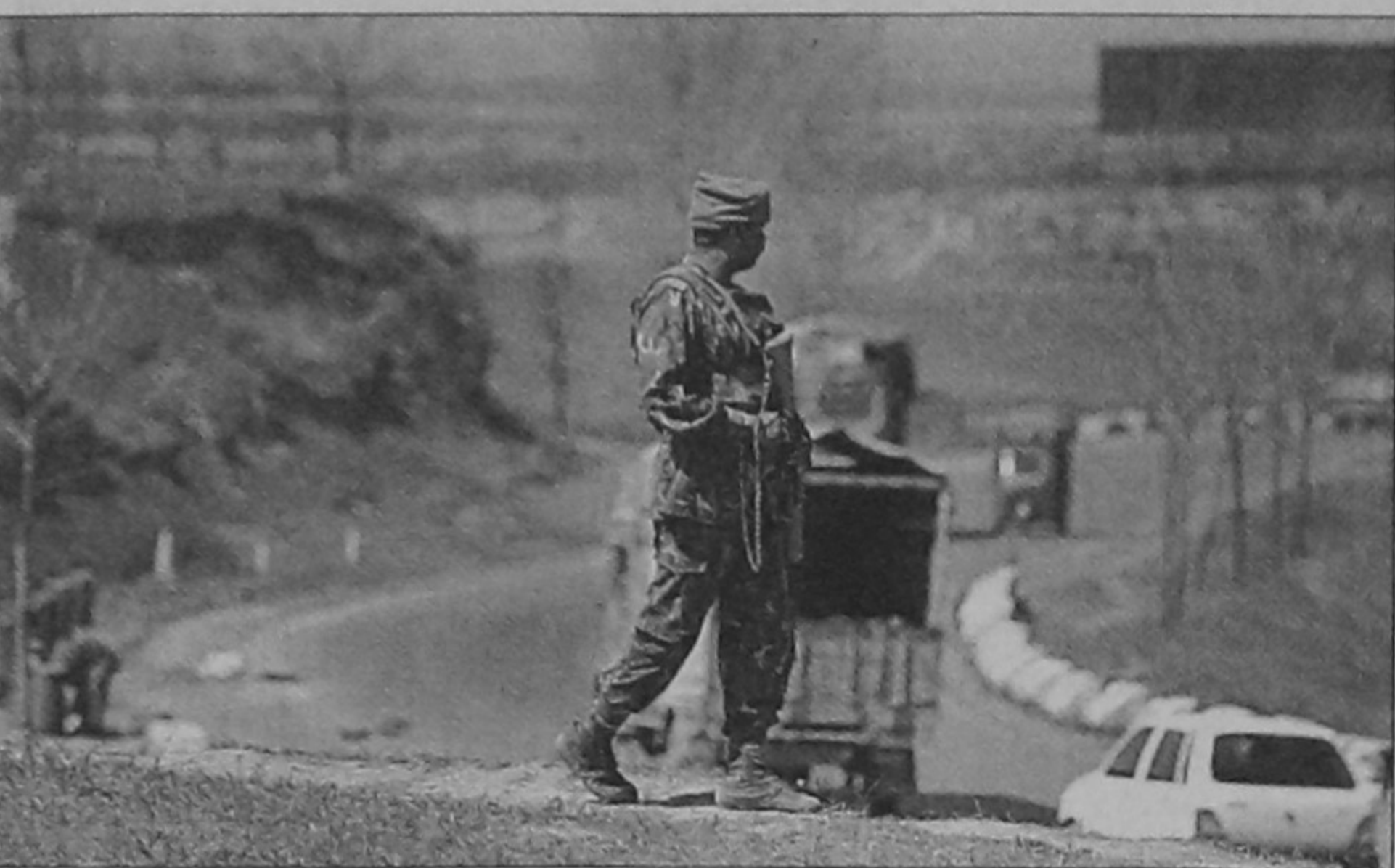
An Indian Paramilitary trooper stands guard near the National Highway at Pampore, south of Srinagar yesterday. Fresh fighting broke-out between the Indian soldiers and heavily-armed militants along the Line of Control (LOC) when a group of rebels tried to infiltrate into India-administered Kashmir from the Pakistani-zone of the disputed region.