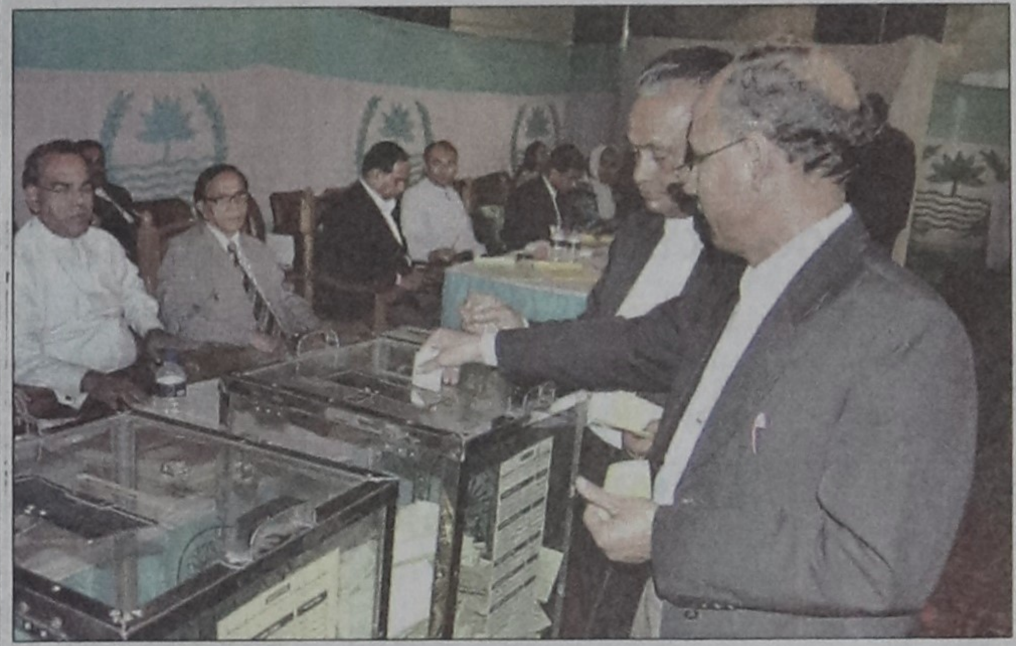
Lawyers cast their votes on the first day of the two-day Supreme Court Bar Association elections at the Supreme Court Bar Council Bhaban in the city yesterday.

They will bring out a silent procession from the Central Shaheed Minar at 11:00am today to press home their demand.