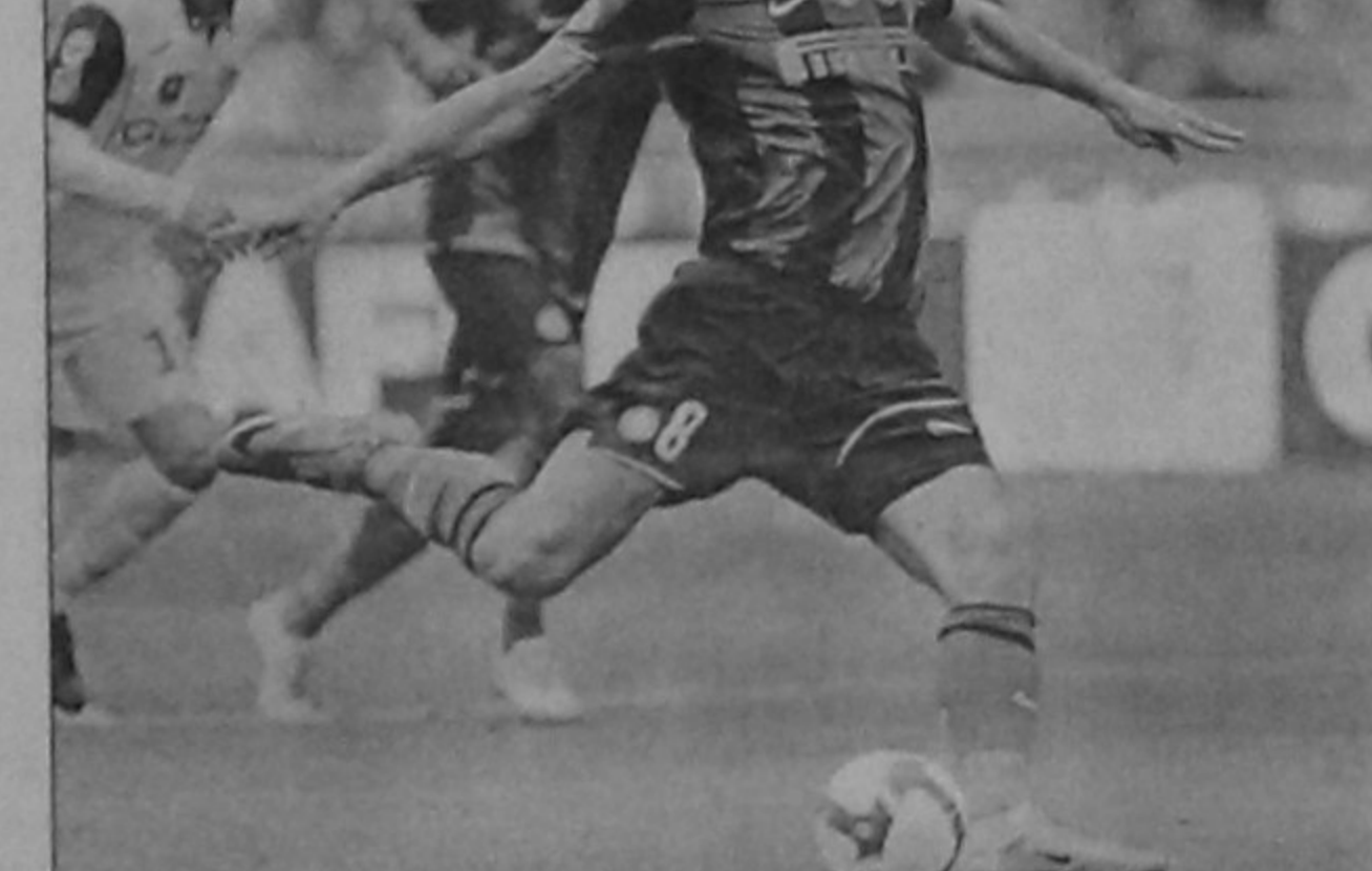
Inter Milan striker Zlatan Ibrahimovic scores from a penalty against Reggina during their Serie A tie at San Siro on Sunday.

Genoa beat Udinese 2-0 at home with goals from Giuseppe Sculli and Diego Milito while Romania captain Adrian Mutu scored the only goal in La Viola's 1-0 home win over Siena.