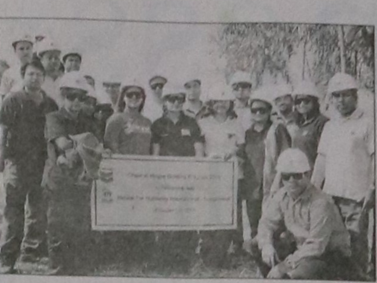
Members of a Chevron Bangladesh team pose for a photograph as they launch a two-day house-building programme at Madhupur in Tangail recently, in partnership with Habitat for Humanity, a non-profit international organisation.

The export-dependent Chinese economy expanded by nine percent in 2008, down steeply from 13-percent growth the year before.