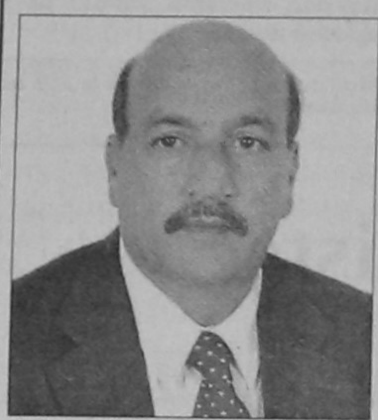
Alamgir Babar High Commissioner of Pakistan to Bangladesh

Films The PNCA was entrusted with the tasks previously handled by the defunct National Film Development Corporation (NAFDEC). The responsibilities include import and distribution of Foreign Feature Films, holding of International Film Festivals in Pakistan, arranging Pakistan's participation in Foreign Film Festivals, boosting of Feature Film Exports, providing dubbing and sub-titling. (Abridged)