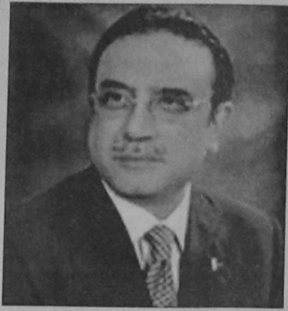
Asif Ali Zardari President of the Islamic Republic of Pakistan