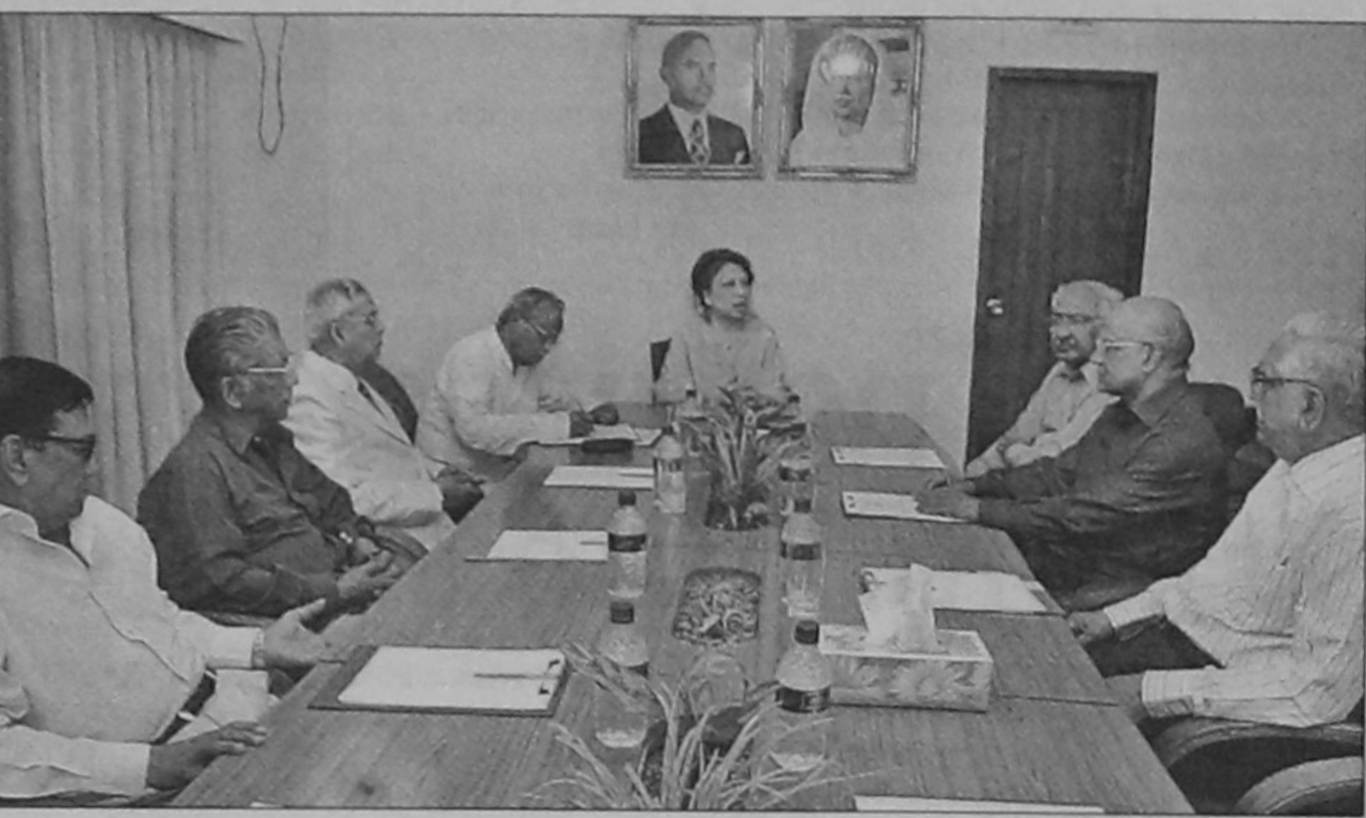
BNP Chairperson Khaled Zia presides over a meeting of standing committee of the party at her Gulshan office in the city yesterday.

Hasan Mahmud said international agencies and friends were also interested to support initiatives taken by the government. He said to reap the maximum benefit from transboundary water resources all the countries in the region should act in a coordinated fashion.