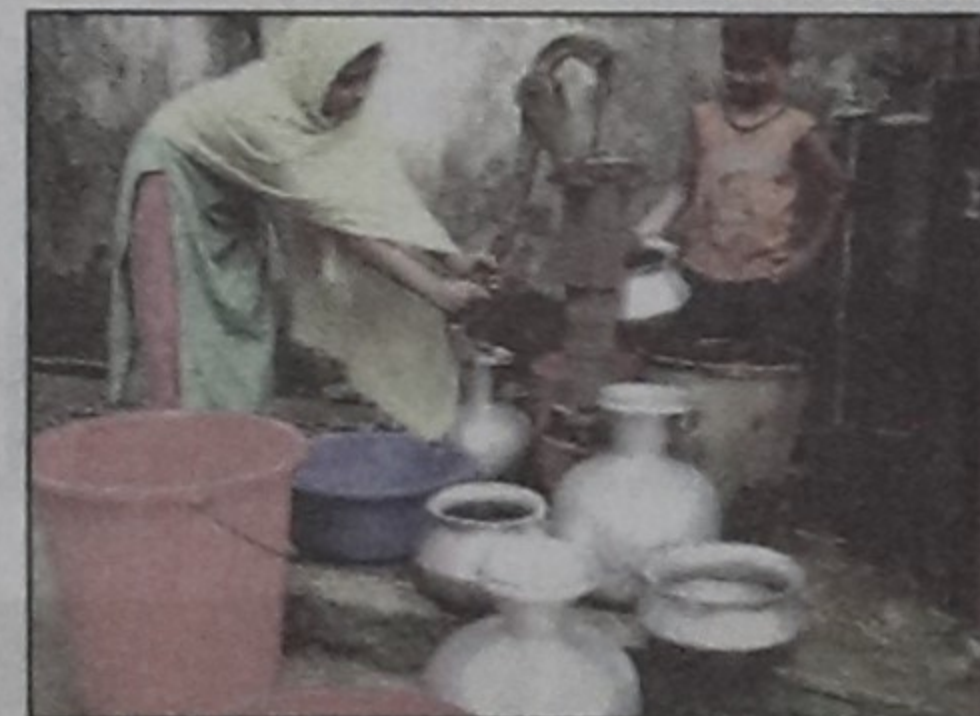
A dried up field on the bank of Hakaluki Haor in Kulaura upazila under Moulvibazar, above, and tube-wells at many places cannot draw sufficient water as underground water level has fallen.

official sources said main sources of surface water for Moulvibazar are rivers Monu, Dholai, Fana, Gupla and Kushiya, haors Hakaluki, Kawadighi and Hail besides the large ponds and natural canals. But most of these are gradually silting up. So these water reservoirs cannot store sufficient water in dry season.