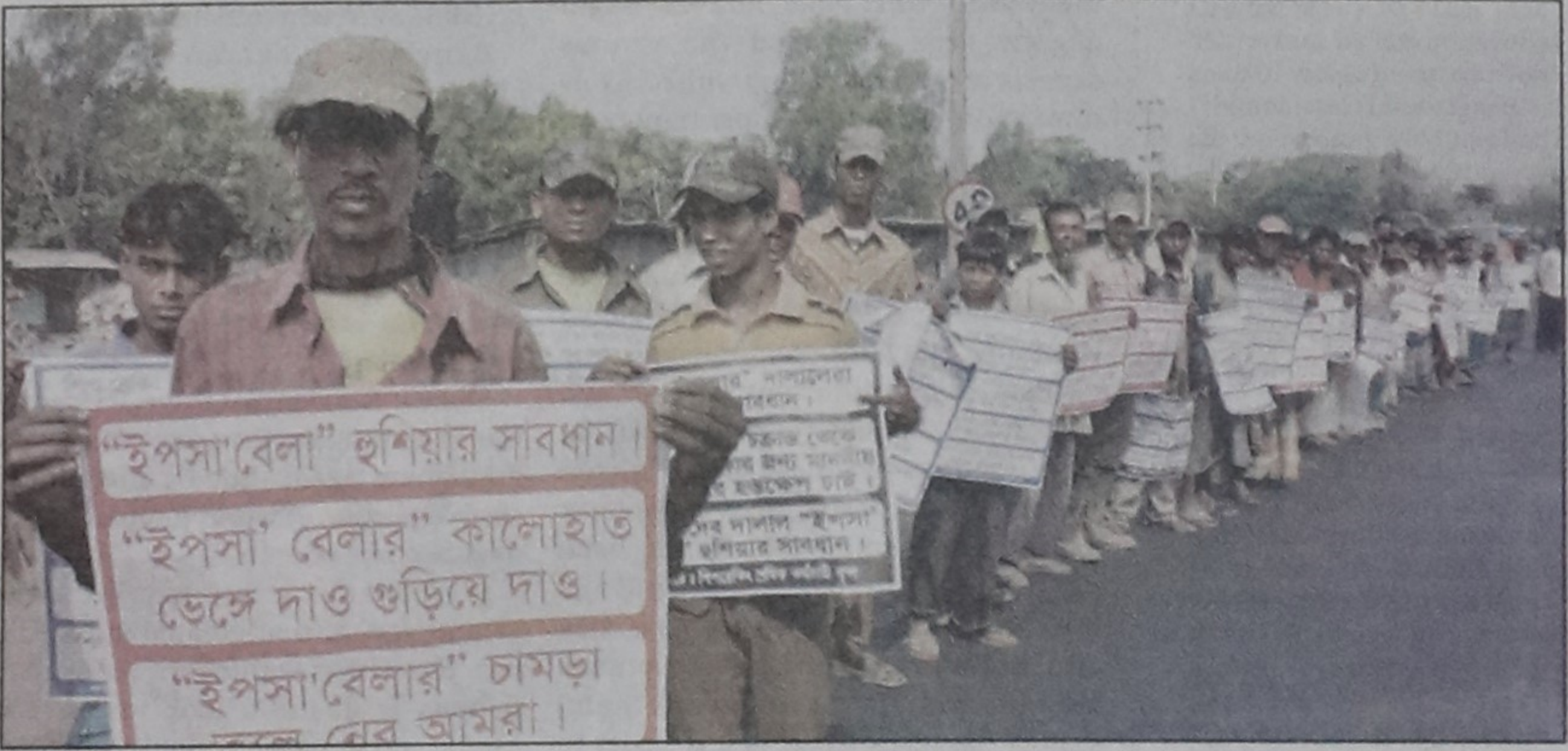
Thousand of jobless workers of ship-breaking yards in Sitakunda form a human chain on Dhaka-Chittagong highway yesterday demanding steps to save the sector.