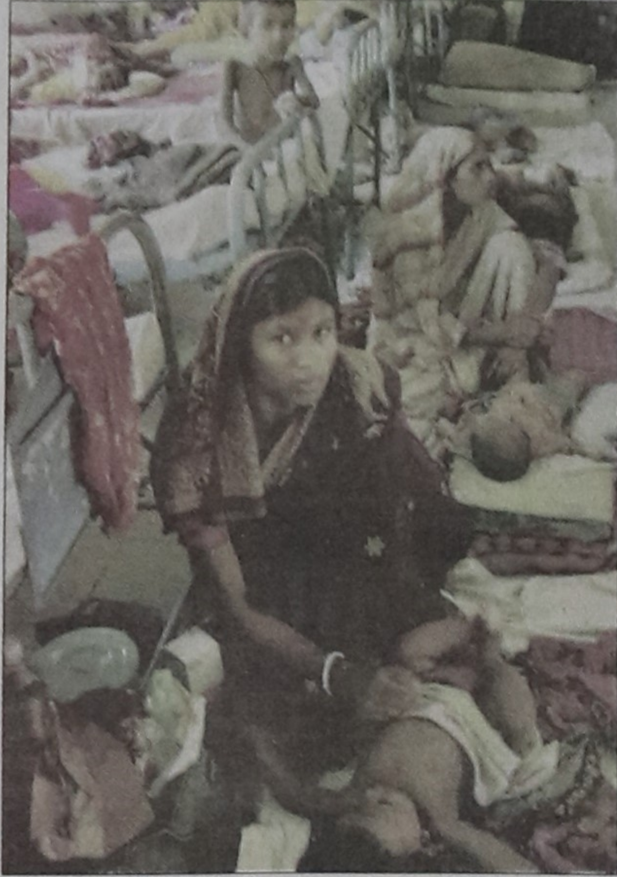
Poor accommodation coupled with shortage of doctors patients struggle to get treatment at Dashmina Upazila Health Complex in Patuakhali. The situation is not much different in most other health care centres in the district.

During a visit to Dashmina upazila Health Complex on Thursday, this correspondent found many patients return-