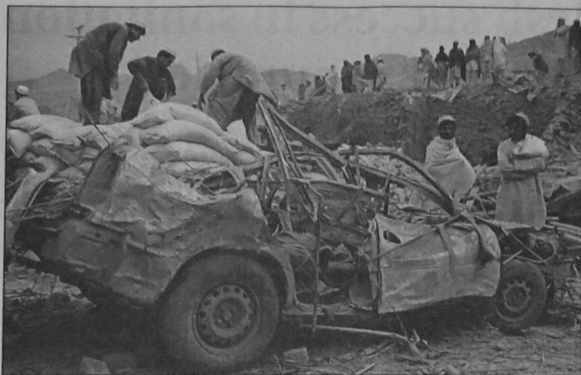
Pakistani tribesmen collect sacks of wheat beside the wreckage left by a rocket attack by militants in Landi Kotal, the main town in Pakistan's volatile Khyber district yesterday. At least 10 people were killed and 45 others wounded when militants fired rockets into a town in Pakistan's semi-autonomous Khyber tribal area on Thursday night.