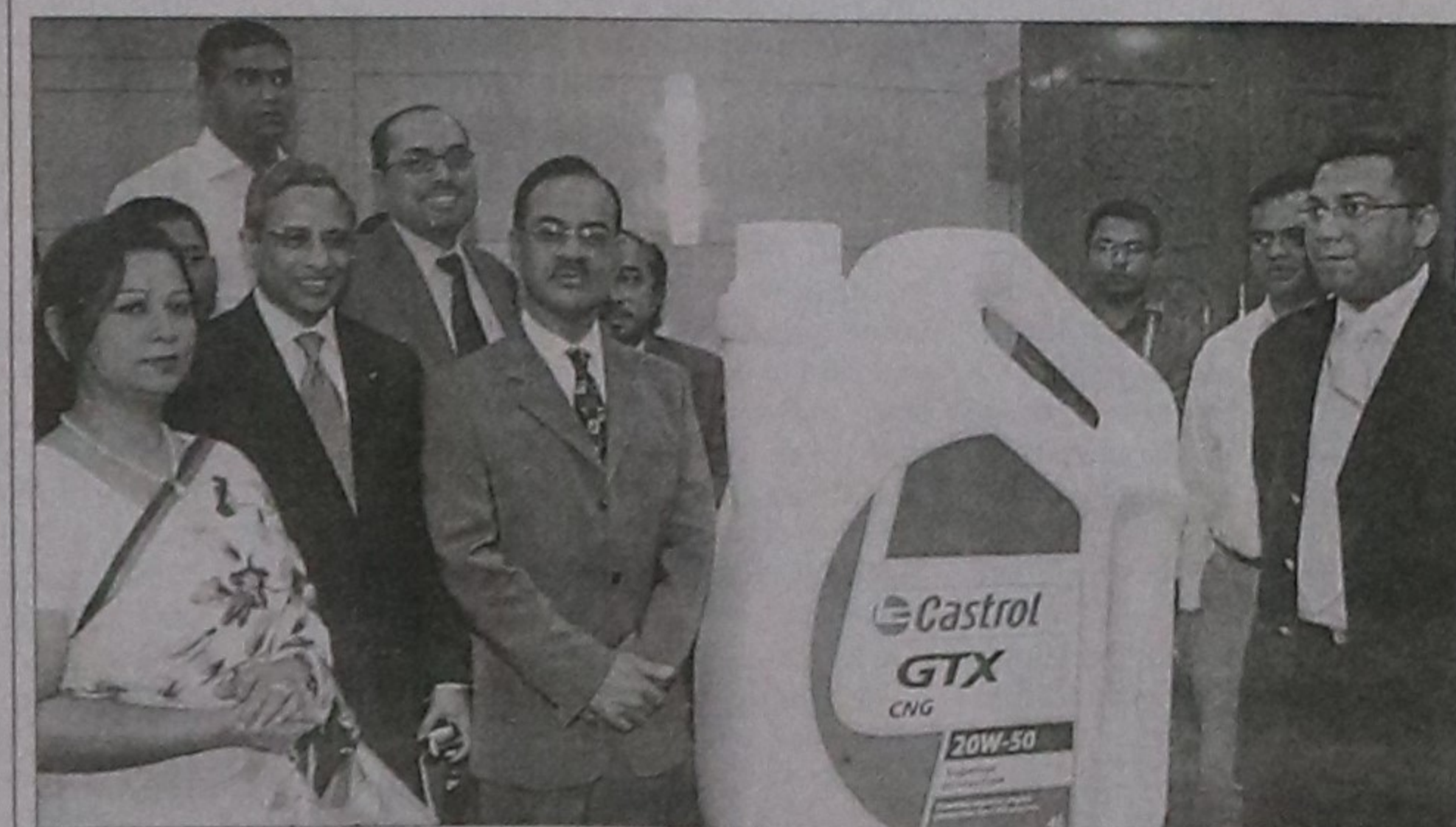
Commerce Minister Faruk Khan launches Castrol GTX CNG engine oil, a new product marketed by Rahimafrooz Distribution Ltd at the 4th Lucas Dhaka Motor Show 2009 that began in the capital Wednesday.

Atiur Rahman favoured increased competition to help consumers remain free from any monopoly or cartels in price fixing.