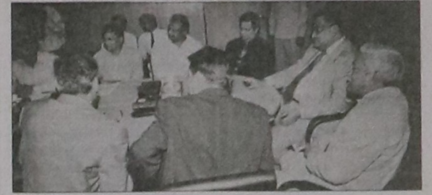
Labour Minister Khandker Mosharraf Hossain attends a view-exchange meeting with a Baira delegation at his office in Dhaka yesterday.

Disclosing the government's plan to groom skilled manpower, the minister said more training centres would