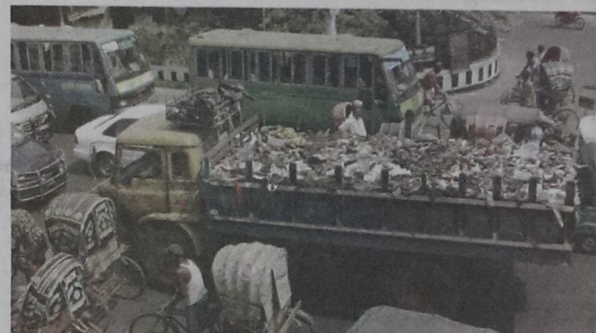
Chittagong City Corporation (CCC) transports garbage on an open truck at daytime, violating its own rules. The photo was taken from Dampara Road on Monday.