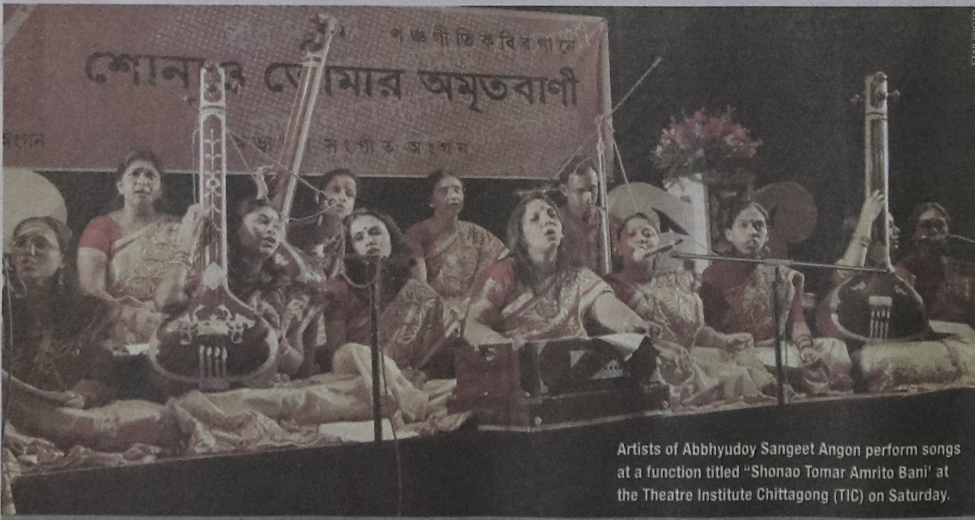
Artists of Abhyyudoy Sangeet Angon perform songs at a function titled "Shonar Tomar Amritobani" at the Theatre Institute Chittagong (TIC) on Saturday.