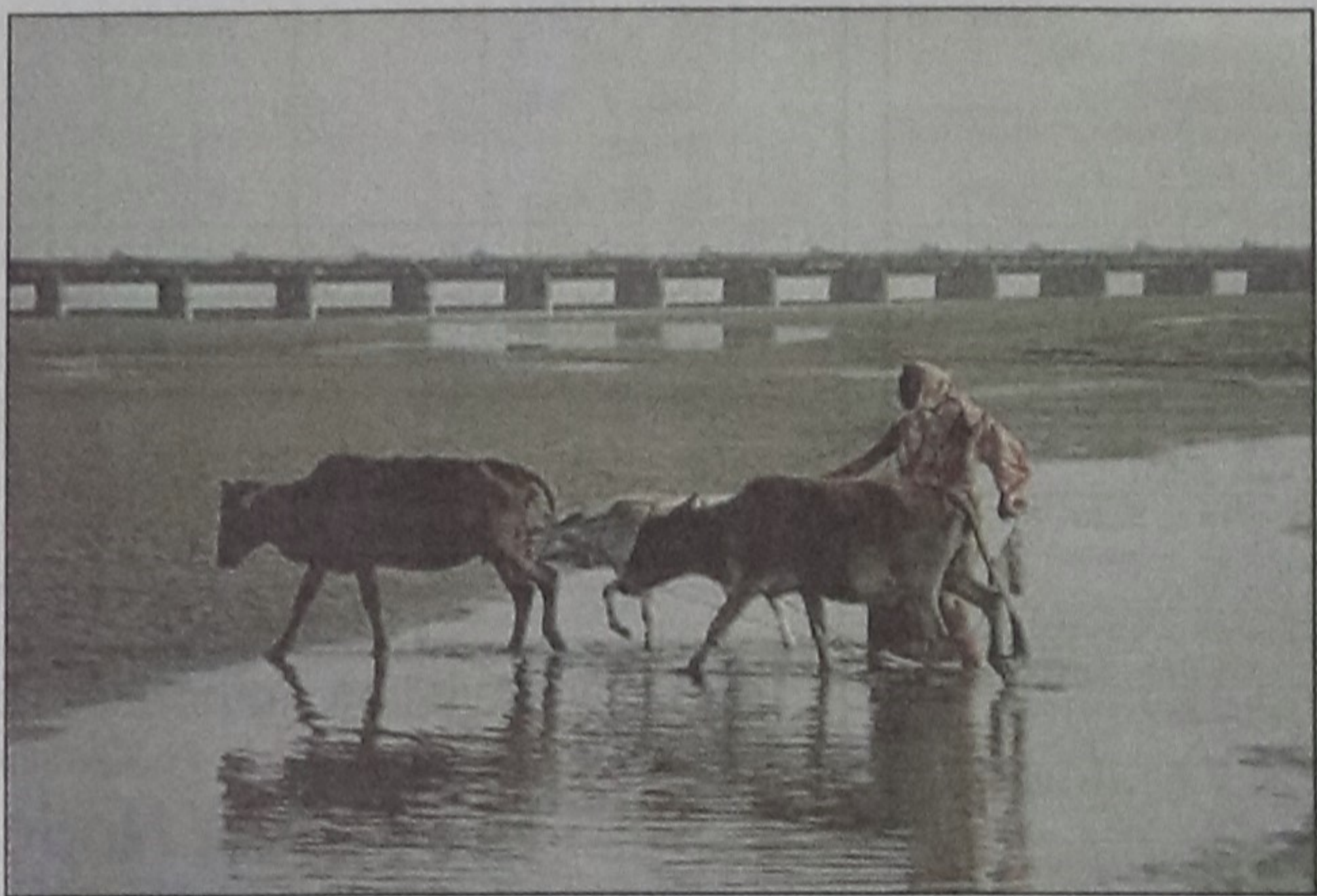
A woman takes her cattle through the dried up bed of the Teesta that sees drastic fall in flow in the upstream of the river's barrage during the dry season.

At many points in Bangladesh part, the river has now turned into a streamlet with water depths as low as 10 centimetres.