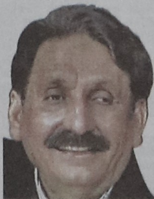
Iftikhar Mohammed Chaudhry

Pakistan's government relented in a major confrontation with the opposition yesterday, agreeing to reinstate a fired Supreme Court chief justice whose fate had sparked street fights and raised