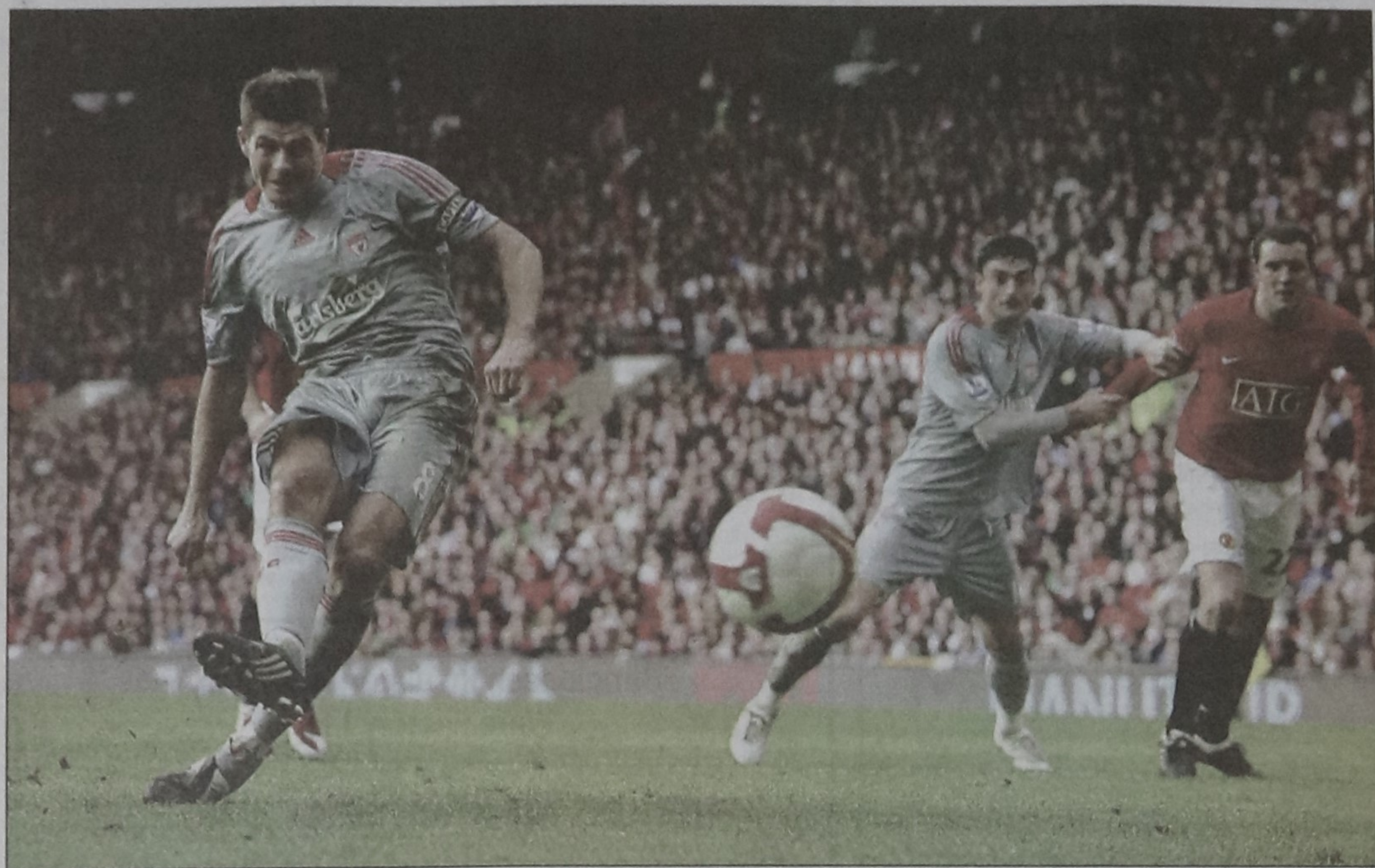
MORE TO COME: Liverpool star Steven Gerrard (L) scores from a penalty to put his side 2-1 ahead in a 4-1 thrashing of Manchester United during their Premier League clash at Old Trafford on Saturday.