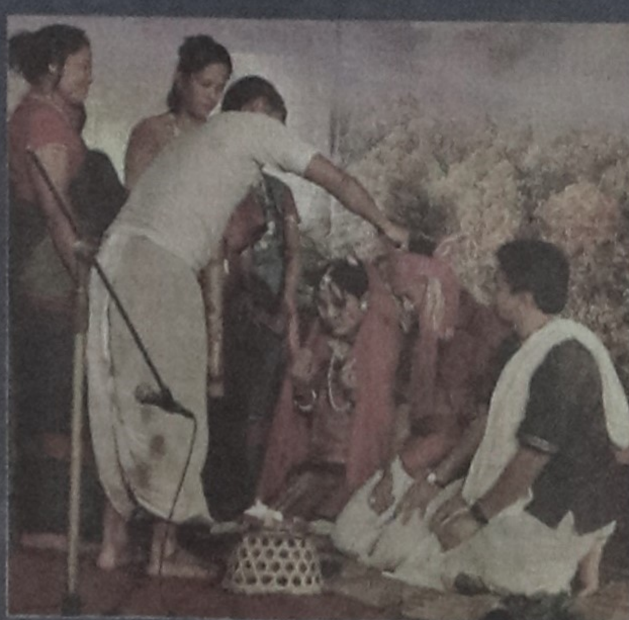
On the second day of Adivasi Cultural Festival 2009, artistes of Khagrachhari Sanskritik Unnayan Kendra staged a play titled "Chumlong" (L). Rakhaia artistes perform a dance number (R). Artistes of ethnic communities Oraon, Chakma, Khyang, and the tea community also performed on at the second day of a three-day festival organised by Society for Environment and Human Development (SEHD). The festival ended yesterday.