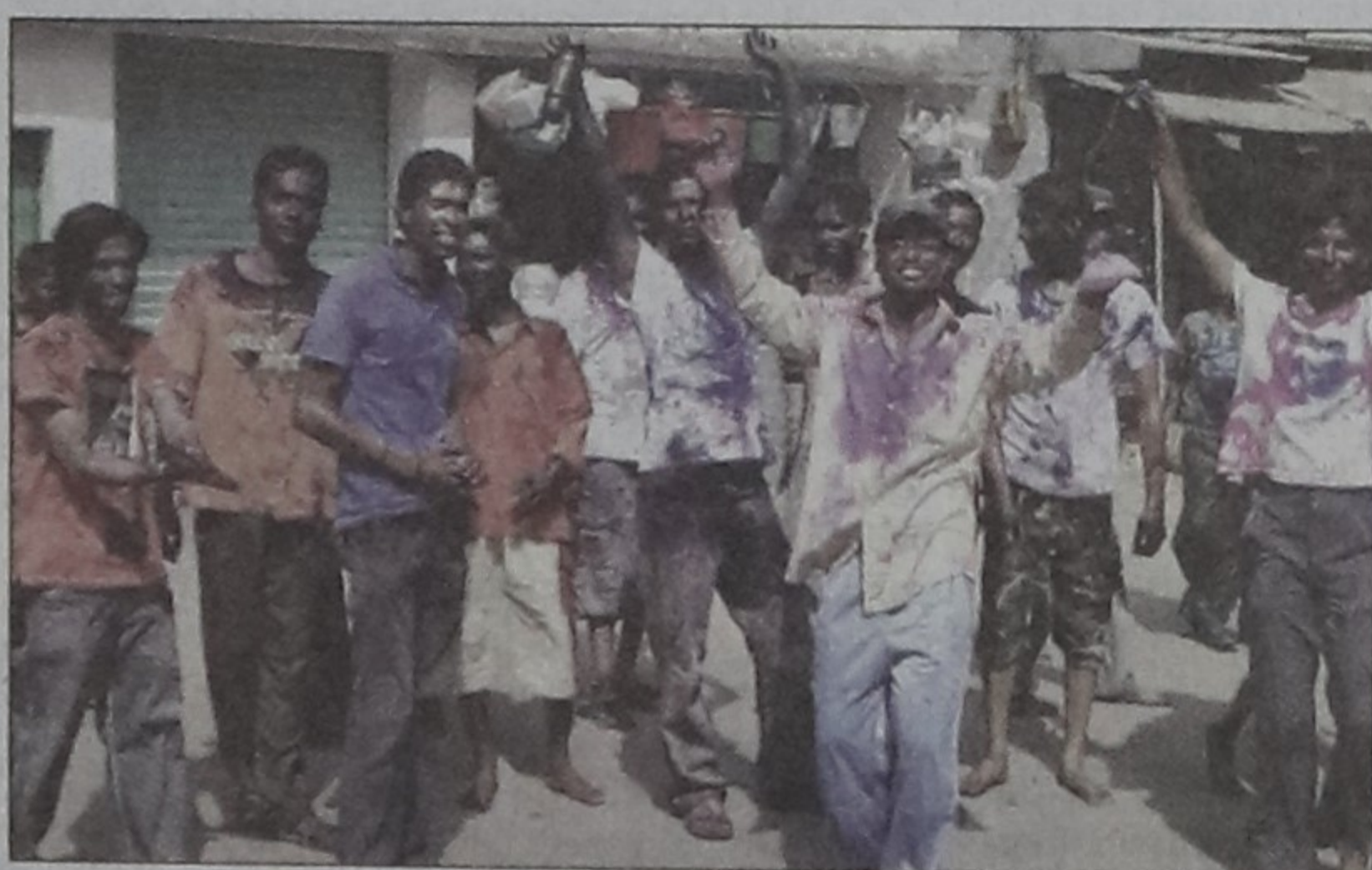
Holi in all its colours in Dinajpur.

Holi here is celebrated in a traditional manner where locals participate in the festival with great enthusiasm upholding the significance of the day.