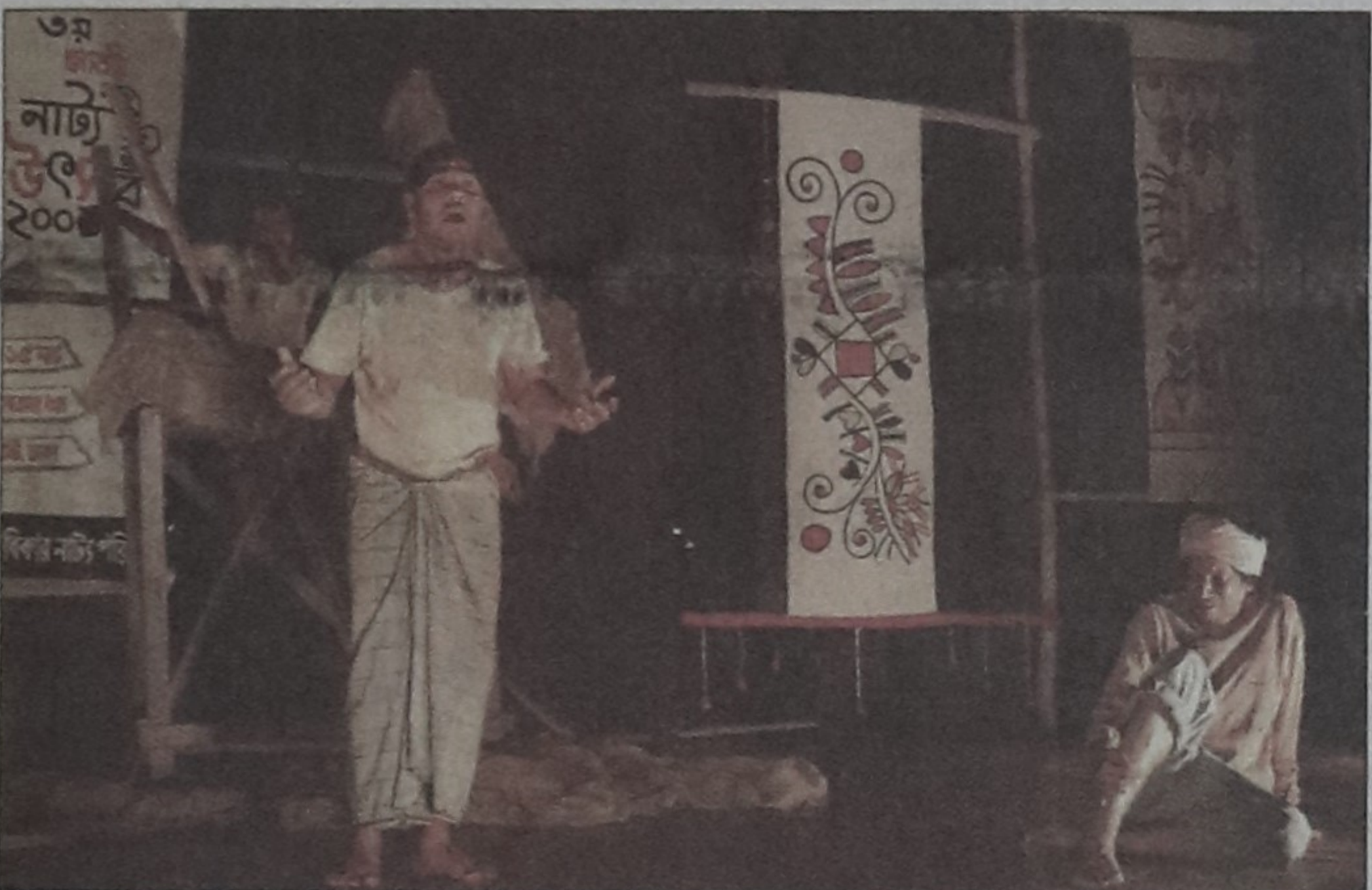
A scene from the play "Akjon Ruhul Amin" staged by Bottola theatre troupe.