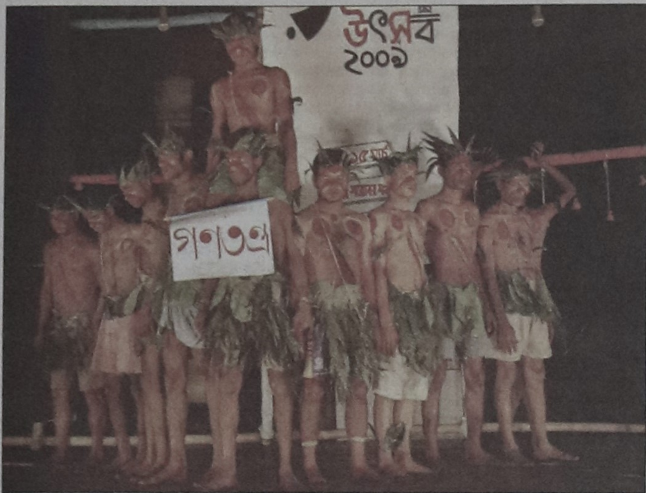
Artistes of Manabadhikar Natya Parishad, Jhenidah were first to perform at the festival.