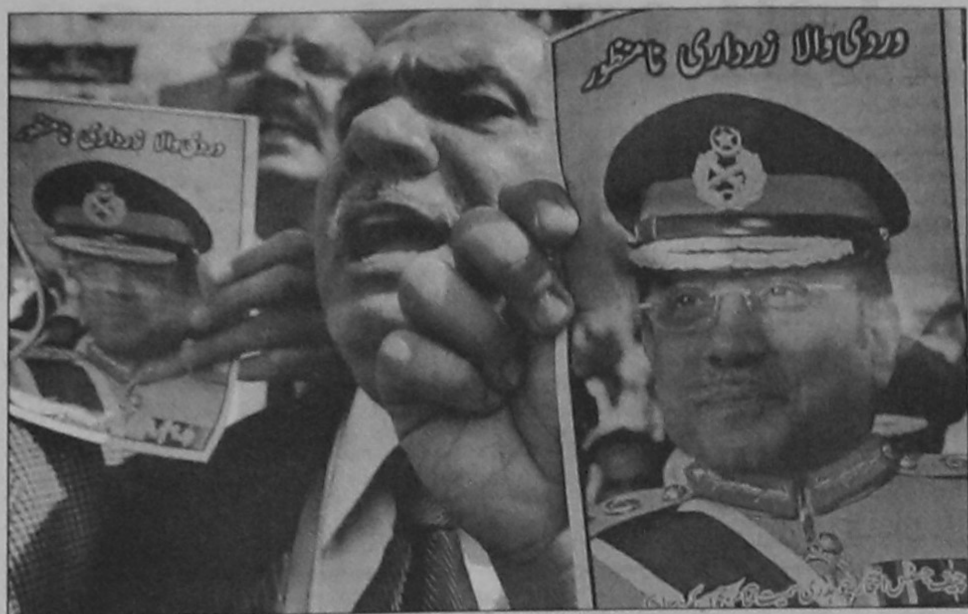
Pakistani anti-government lawyers hold posters of Pakistan President Asif Ali Zardari in army uniform during a protest in Lahore yesterday. Zardari, whose popularity ratings are at rock bottom, is locked in a standoff with the main opposition leader Nawaz Sharif over demands that he reinstate judges sacked by former military ruler Pervez Musharraf.