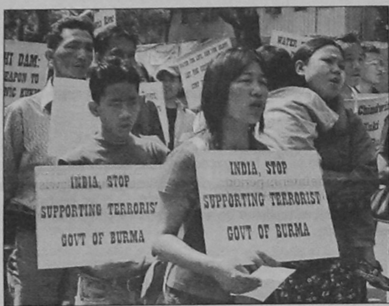
Activists from the Burmese Kuki Students' Democratic Front shout slogans during a protest in New Delhi yesterday against the Tamanthi Dam and Multipurpose Project on the International Day of Action for River, Water and Life.