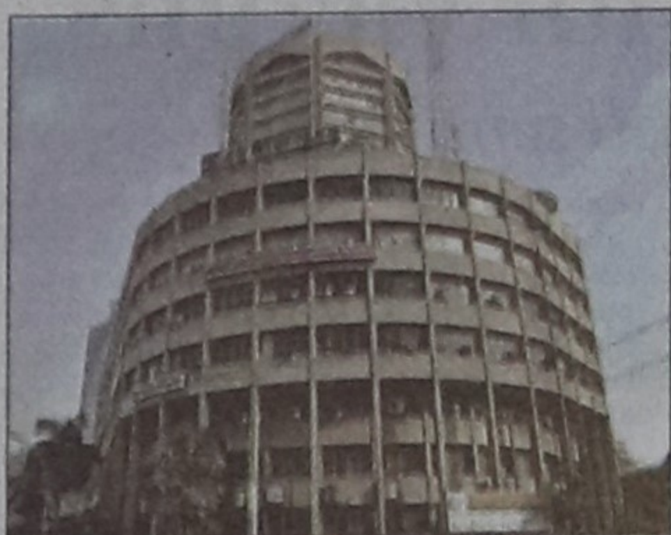
The 20-storey Jiban Bima Tower is one of the many high-rise buildings at risk in the city as most of its fire-safety measures are inoperative.