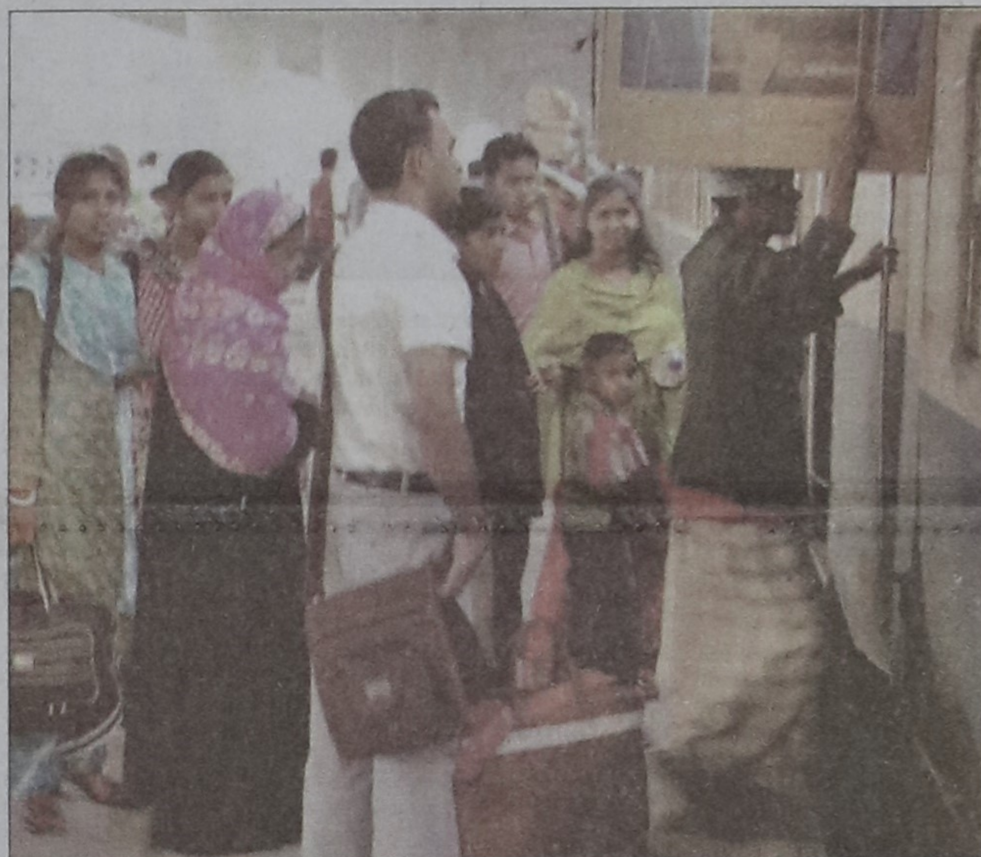
Students queue at Rajshahi Railway Station yesterday as they leave their hostels after the authorities shut down Rajshahi University and several other educational institutions for an indefinite period following violent clashes on RU campus Friday.