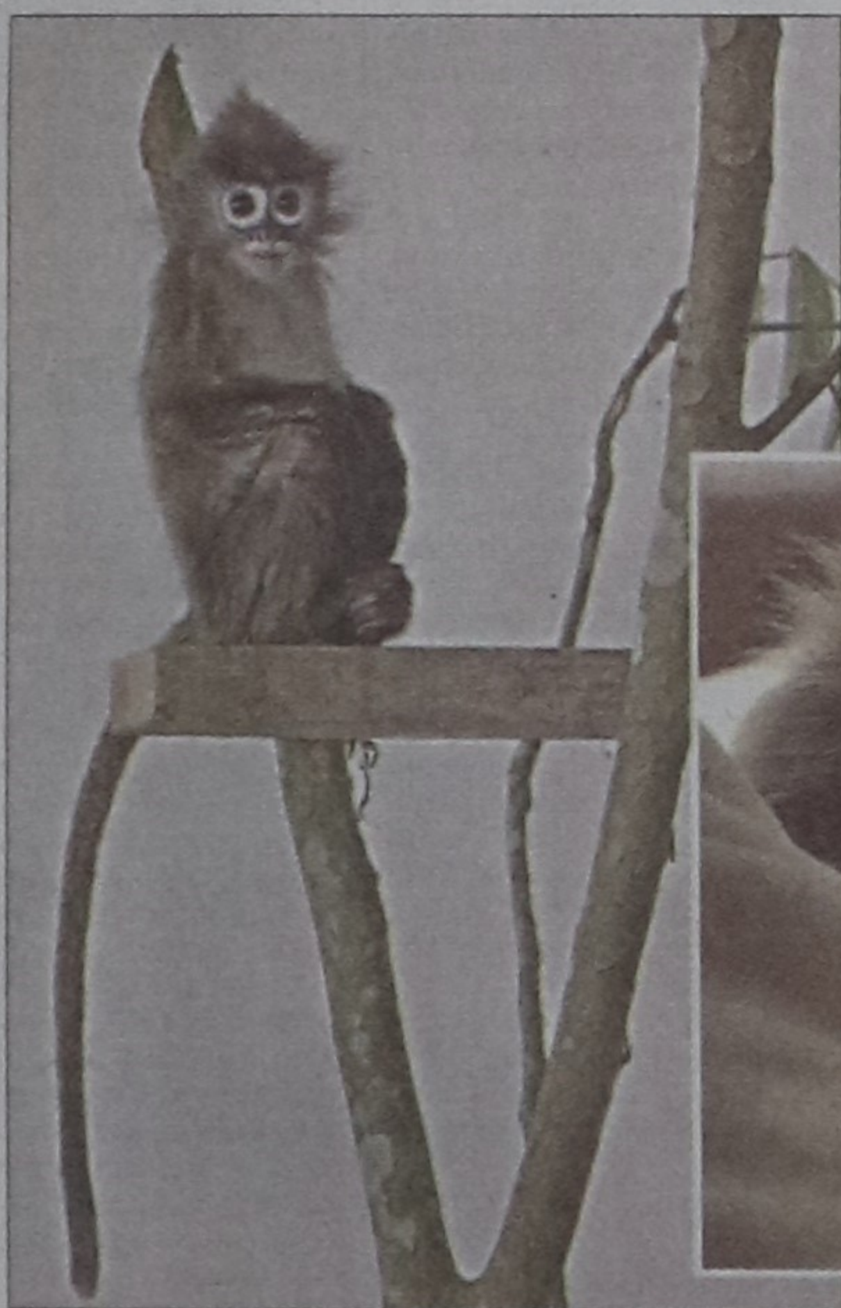
A rare wild monkey sits in its new home at the Forest Department's rescue centre after it was rescued from Srimongol. Inset, a closer view of the white circles around its eyes - which gives it the local name of Chasmapora Banor.