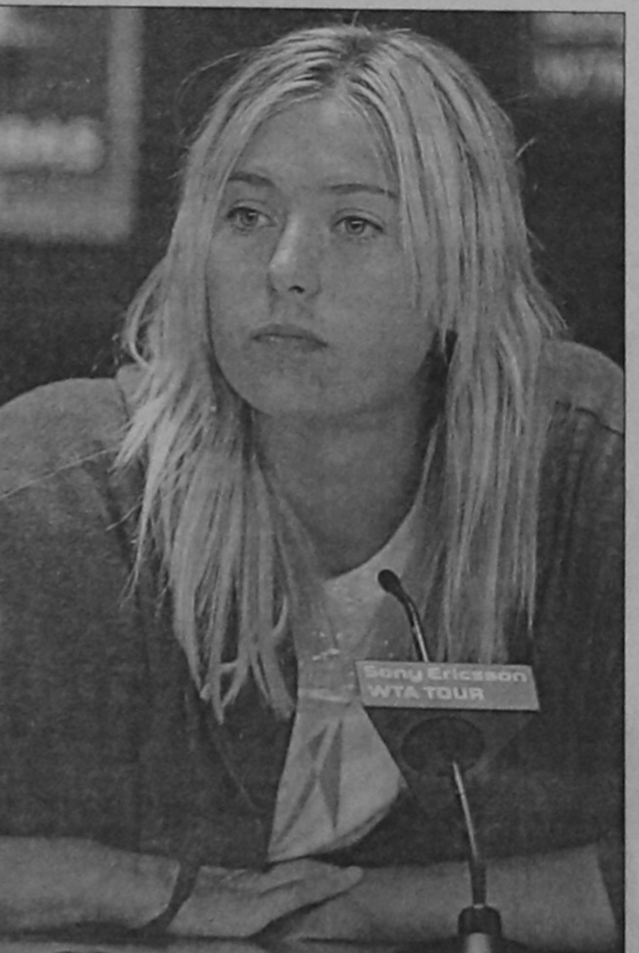
Russian star Maria Sharapova addresses a press conference during the BNP Paribas Open at the Indian Wells Tennis Garden on Thursday.

And Hamburg host Energie Cottbus desperate to get back into the title race after last week's upset by Moenchengladbach.