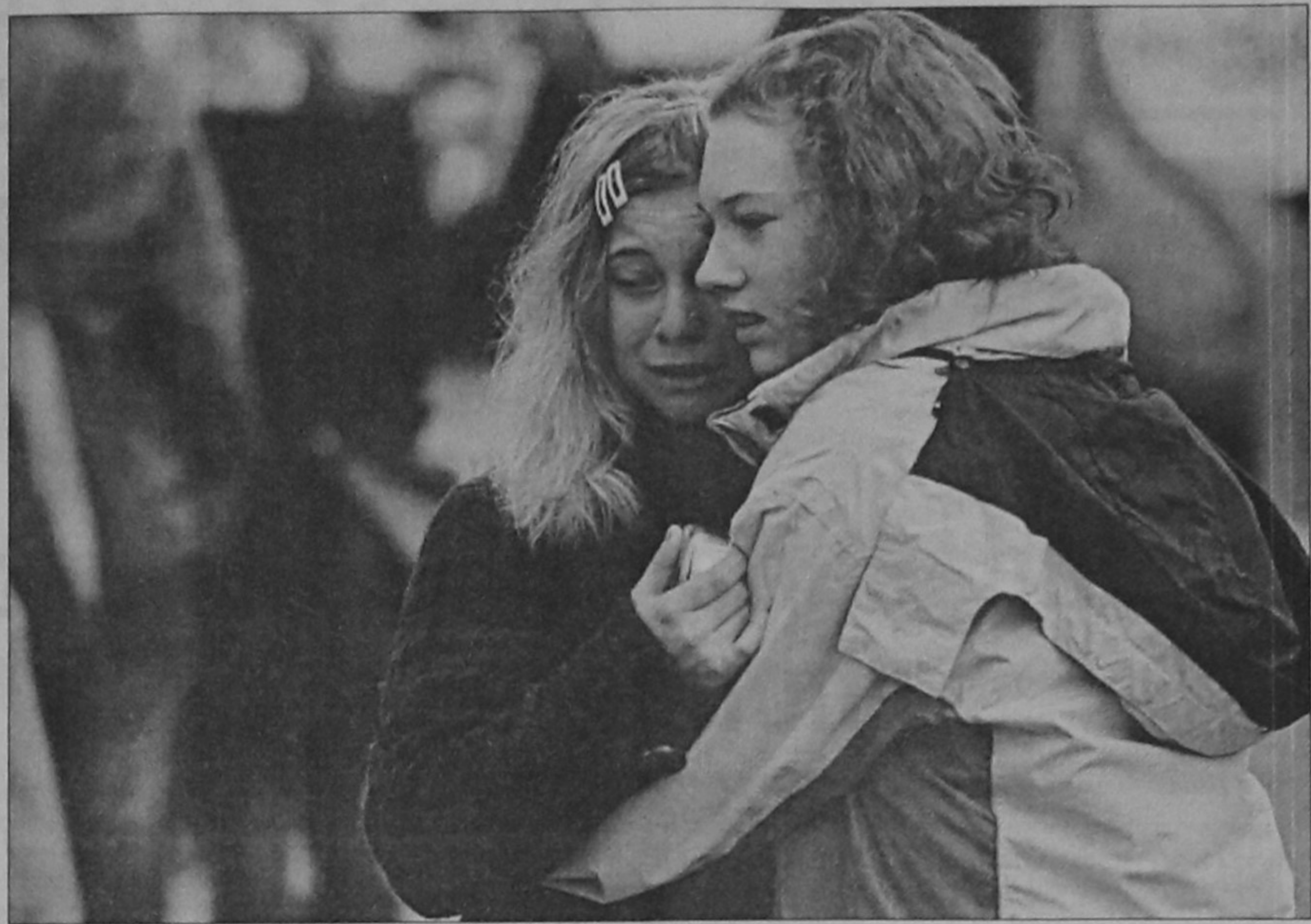
Residents comfort each other in front of the Albertville secondary school in Winnenden, southern Germany yesterday. A teenager in black combat gear went on the rampage at his former school, killing at least 16 people before fleeing and sparking a major manhunt.

If Left parties' strength comes down in the elections, many of the Third Front partners could quickly drift and jump out to back either Congress or BJP, depending on political expediency and exigency, analysts say.