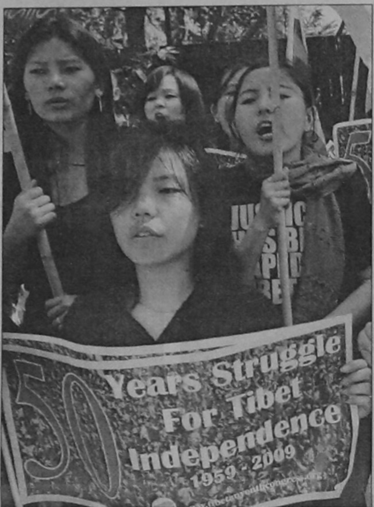
Tibetan women shout anti-Chinese slogans during a protest in front of the United Nations (UN) Regional Headquarters in New Delhi yesterday as they commemorate the 50th anniversary of the Tibetan uprising.

The resolution, which does not threaten action if Beijing fails to comply, came amid heightened tensions between China and the United States after navy vessels from the two countries clashed in the South China Sea.