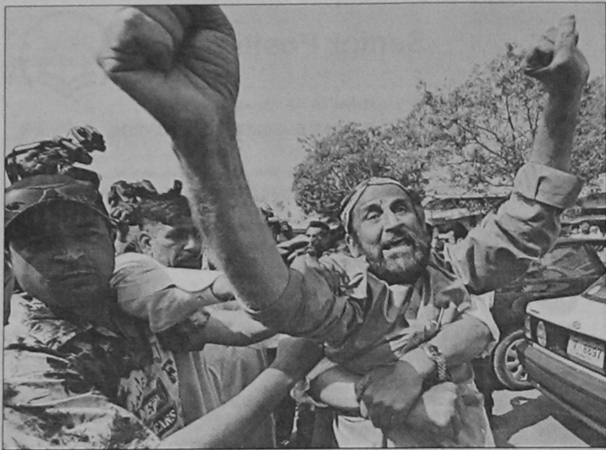
Pakistani plainclothes policemen arrest a political party activist during a protest in Karachi yesterday. Lawyers in black suits and opposition party activists carrying flags and punching their fists in the air marched in Pakistan's biggest city demanding that embattled President Asif Ali Zardari reinstate sacked judges.