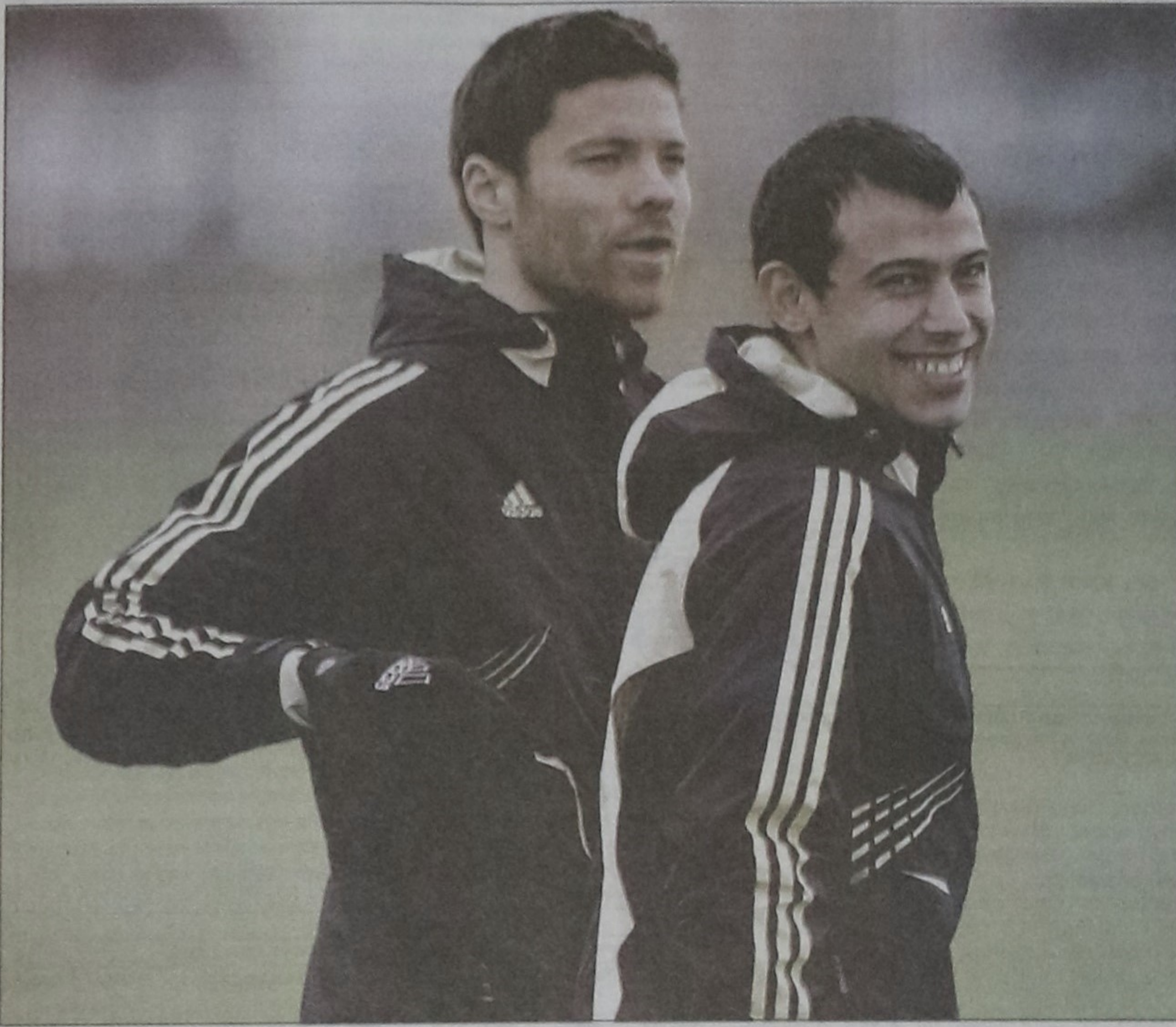
Liverpool midfielders Xabi Alonso (L) and Javier Mascherano smile during a training session in Melwood on Monday, ahead of their Champions League tie against Real Madrid in Anfield on Tuesday.