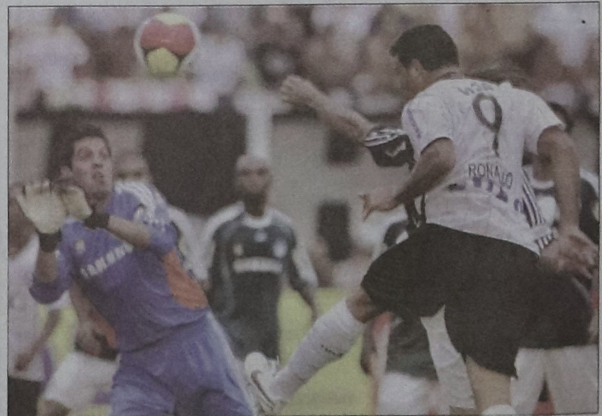
Corinthians have taken objection to Manchester United's rampant marketing of Cristiano Ronaldo, and have used a novel T-shirt (L) as a means of reminding the Red Devils that another Ronaldo is still alive and very much kicking as evidenced by this last-gasp equalising goal (top) from the Brazilian legend in their league match against Palmeiras in just his second appearance for his new club.

by journalists. He had already shown glimpses of his returning genius, firing just over with a curling shot from 25 yards a few minutes