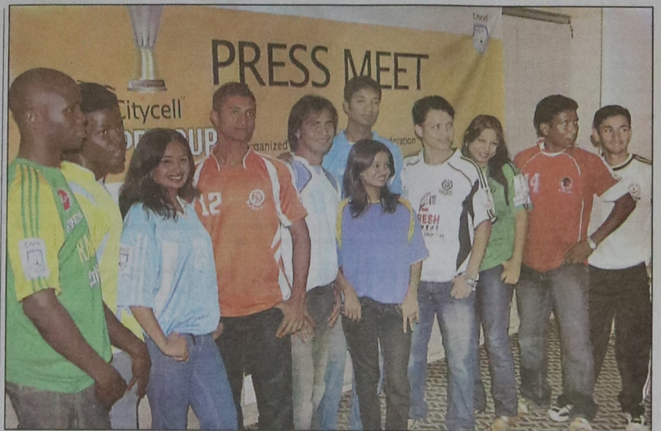
The captains of the Super Cup teams show the team shirts along with models at the BFF Bhaban yesterday.