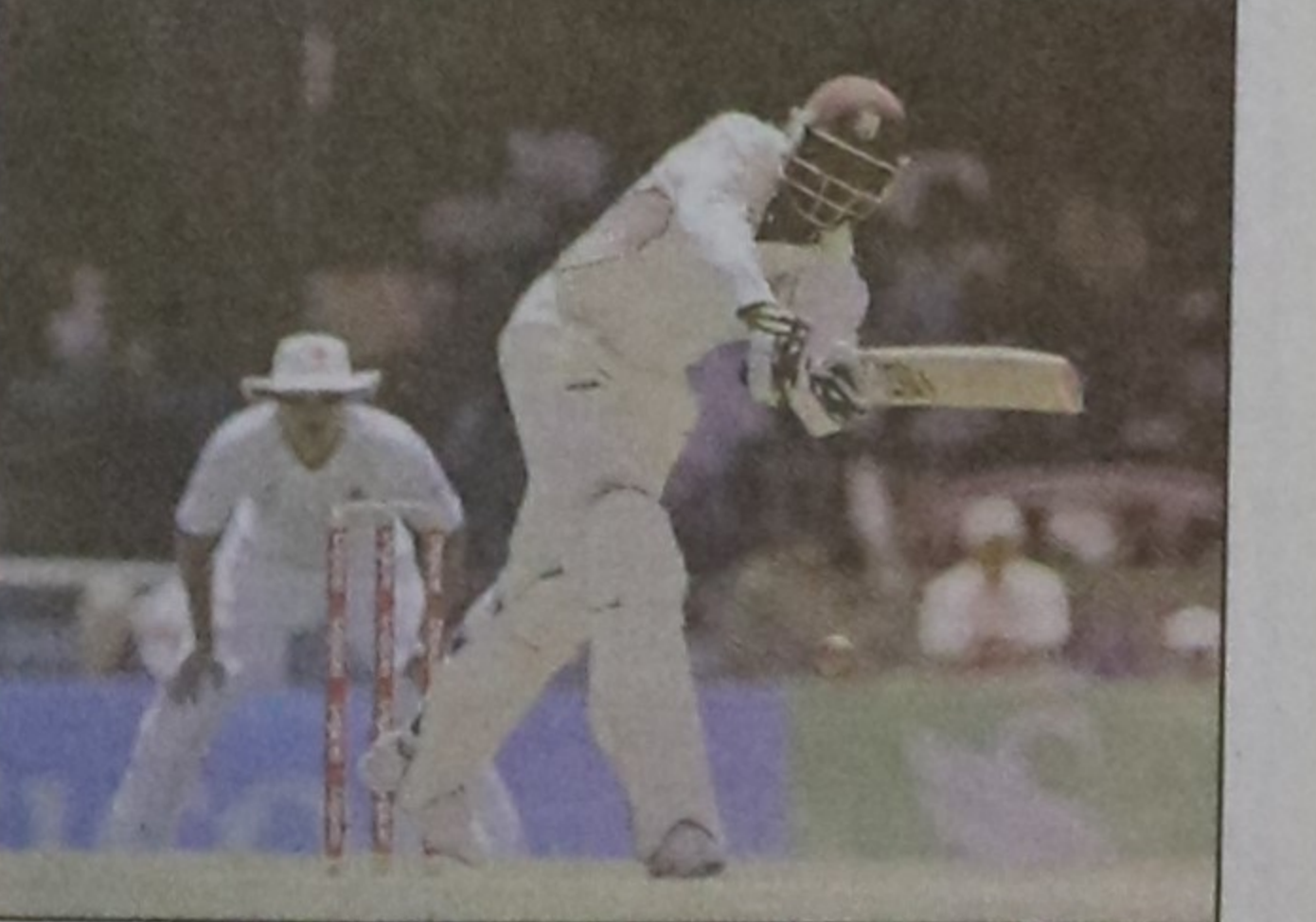
West Indies captain Chris Gayle flicks on the on-side during the third day of the fifth and final Test against England at Queen's Park Oval in Port of Spain on Sunday.