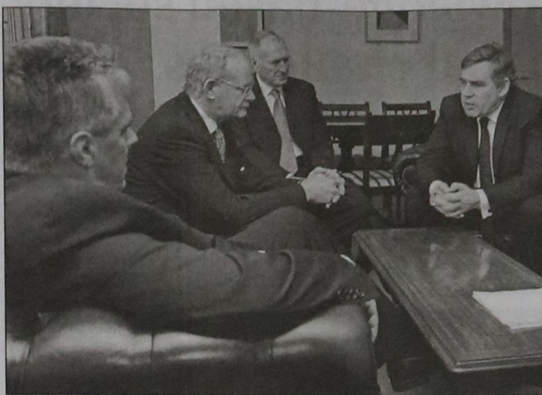
British Prime Minister Gordon Brown (R) and Security Minister Paul Goggins (2nd R) meet Northern Ireland's First Minister Peter Robinson (L) and Deputy First Minister Martin McGuinness (2nd L) at Castle Buildings in Stormont, Belfast yesterday.

violence could return to Northern Ireland, which has seen relative peace since 30 years of sectarian bloodshed was largely ended with the 1998 Good Friday peace accords. Gerry Adams, the leader of Sinn Fein, the province's main republican Catholic party and the political wing of the now-defunct Irish Republican Army (IRA), said those behind the attack had no popular support and no strategy. But he accused Northern Ireland's police chief Hugh Orde of making a "huge mistake" by calling in a small number of army surveillance specialists to track dissident republicans -- a move Orde admitted just 36 hours before the attack. Republicans want Northern Ireland to leave the United Kingdom and join the Republic of Ireland to the south. Leaders on all sides have condemned the attack.