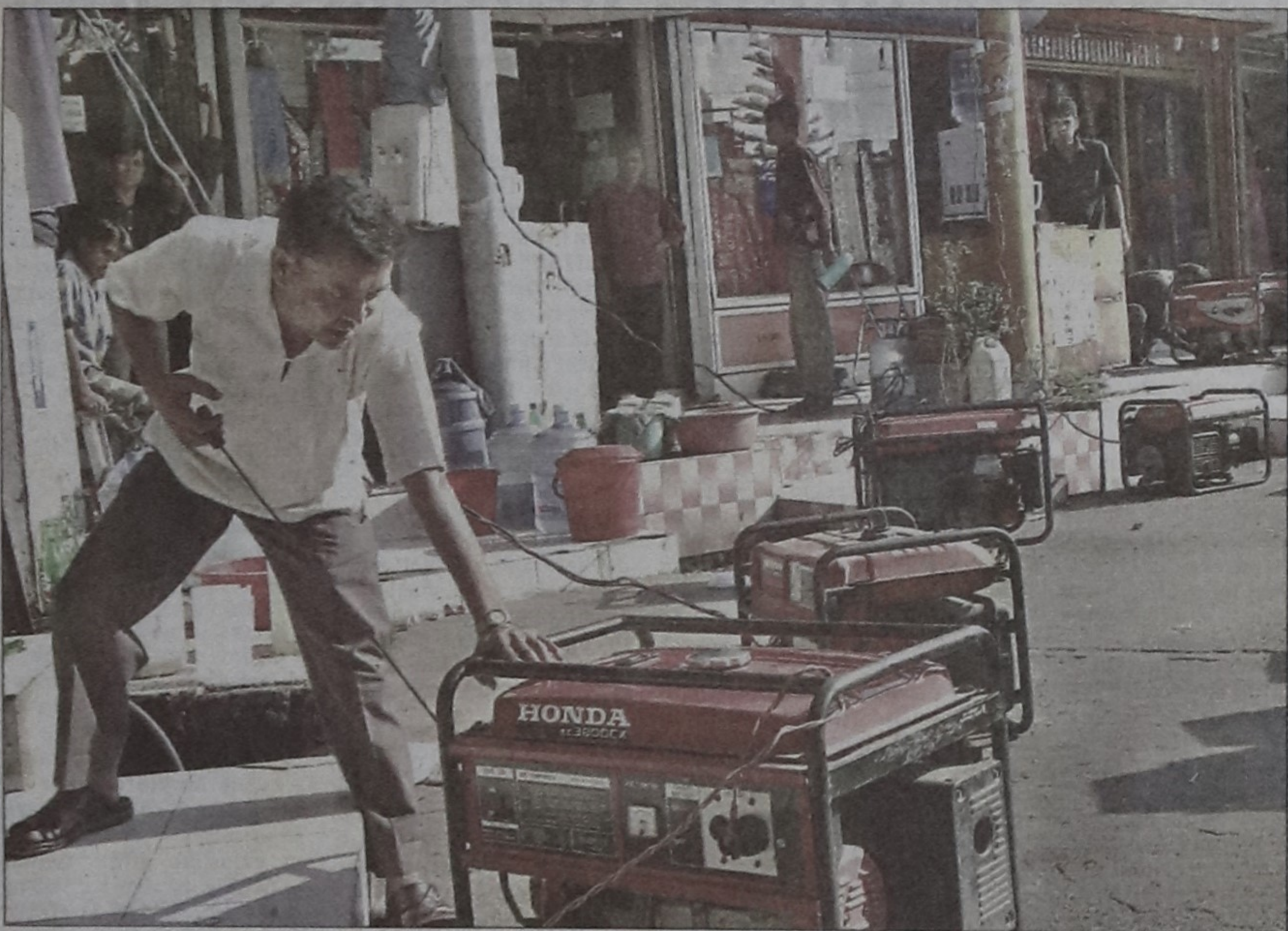
A shopkeeper at New Market in the capital starts a generator as frequent power cuts put city life in distress. The power cuts in the capital have been increasing in duration and frequency as the summer approaches.