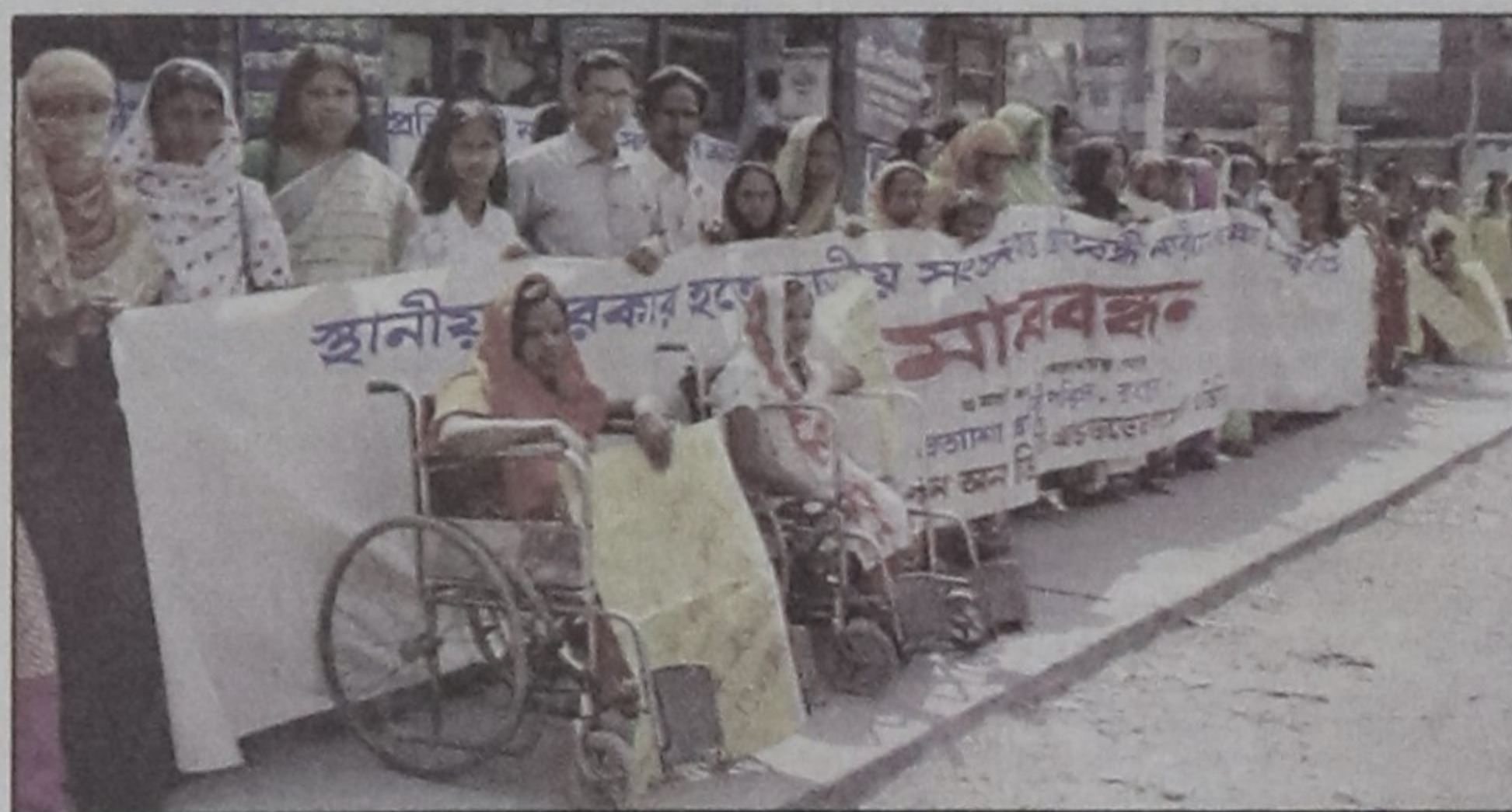
Protyasha Protibandhi Nari Parishad forms a human chain in front of Rangpur Press Club yesterday demanding six reserved seats in parliament for physically challenged women and ensuring their participation in all local government bodies.

Similar programme was also observed in Patuakhali, Pabna, Jhenidah, Kurigram, Lalmonirhat, Thakurgaon, Tangail, Barisal, Comilla, B'baria, Mymensingh, Jhalakathi, Manikganj and Netrakona.