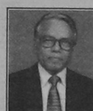
Nurul Islam Nahid M.P. Minister