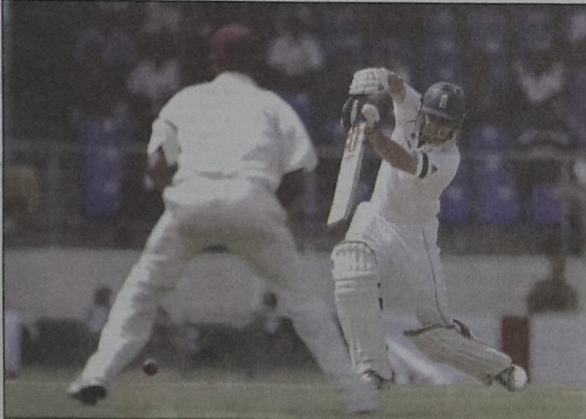
England skipper Andrew Strauss hits a bowler's back drive during his unbeaten knock of 139 on the opening day of the fifth and final Test against the West Indies at Queen's Park Oval in Port of Spain on Friday.