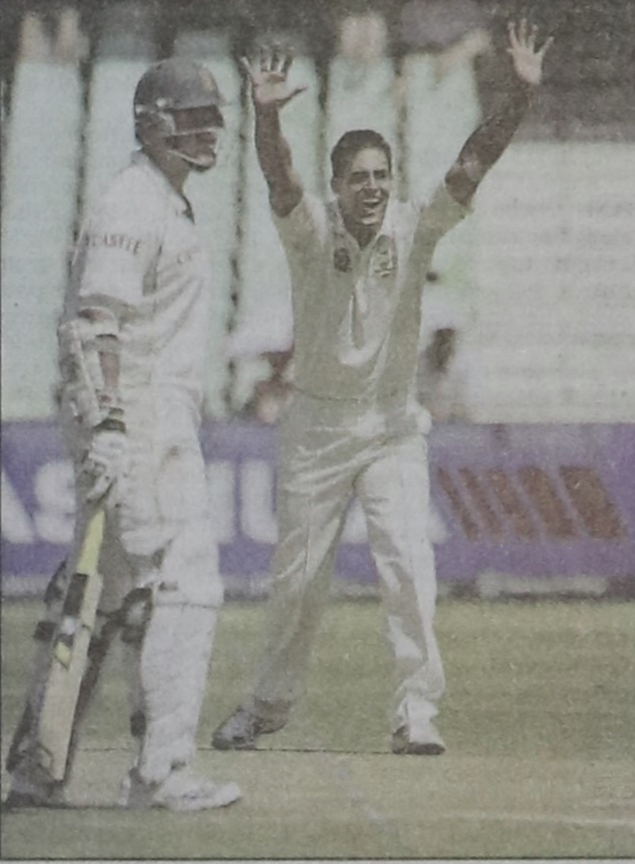
SPITTING VENOM: Australia's left-arm paceman Mitchell Johnson (R) celebrates after having South Africa's one-down batsman Hashim Amla (not in picture) trapped leg before in an eventful first over where he also dismissed opener Neil McKenzie on the second day of the second Test at Kingsmead in Durban yesterday.