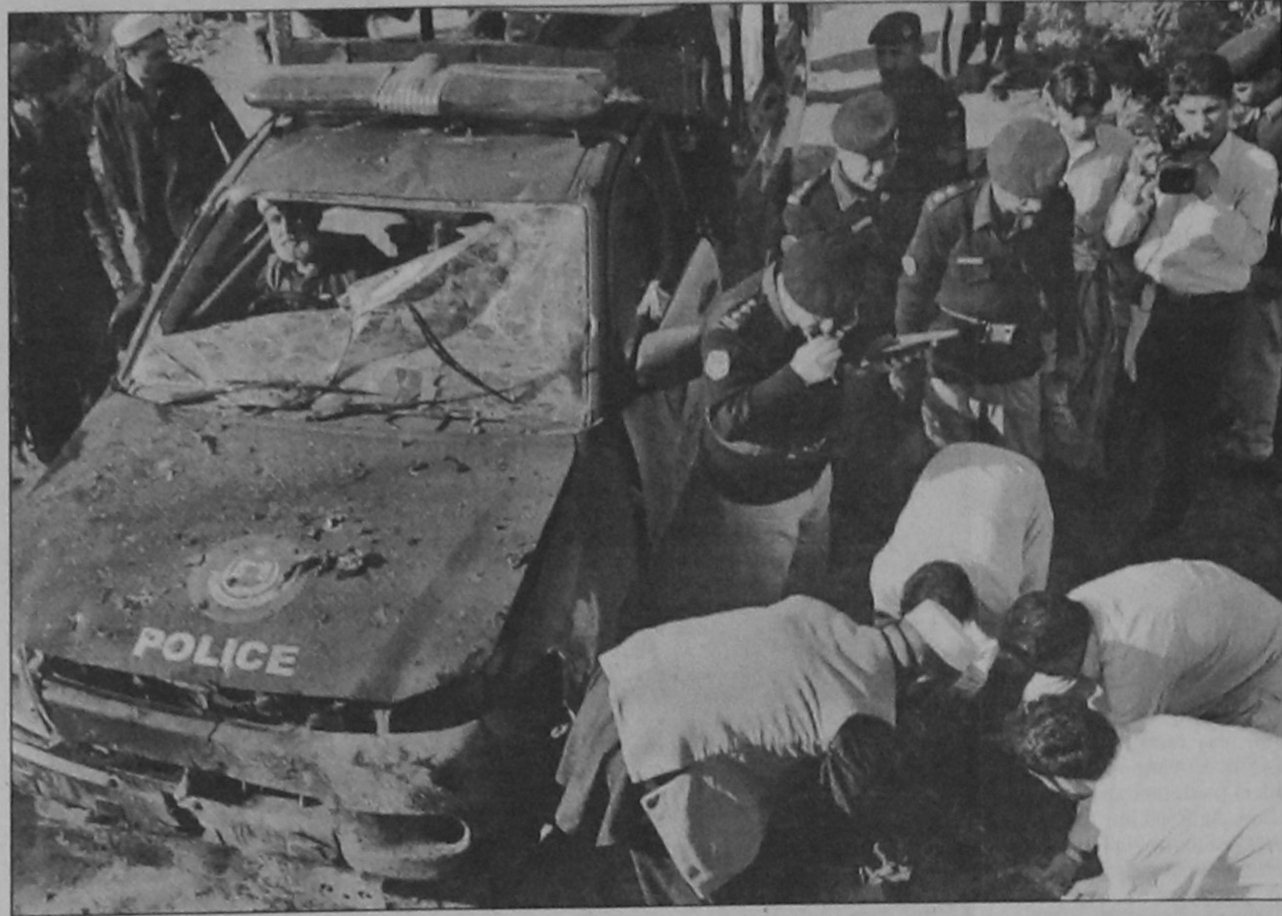
Policemen inspect a police van after an explosion on the outskirts of Peshawar yesterday. At least seven Pakistani security forces and four civilians were killed when a car bomb exploded on the outskirts of Peshawar.