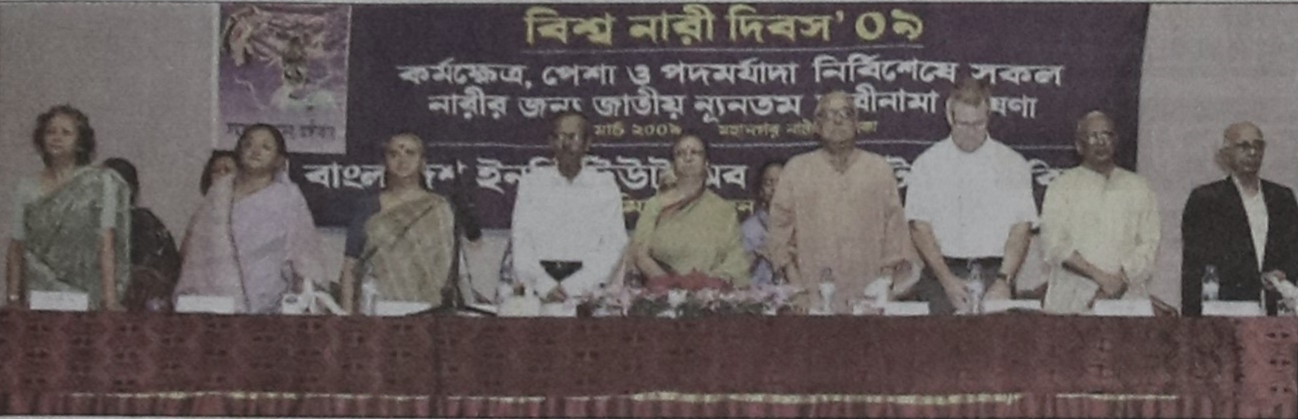
Participants stand during the national anthem at the inaugural ceremony of a discussion marking the International Women's Day at Mahanagar Natyamancha in the city yesterday. Bangladesh Institute of Labour Studies organised the event.