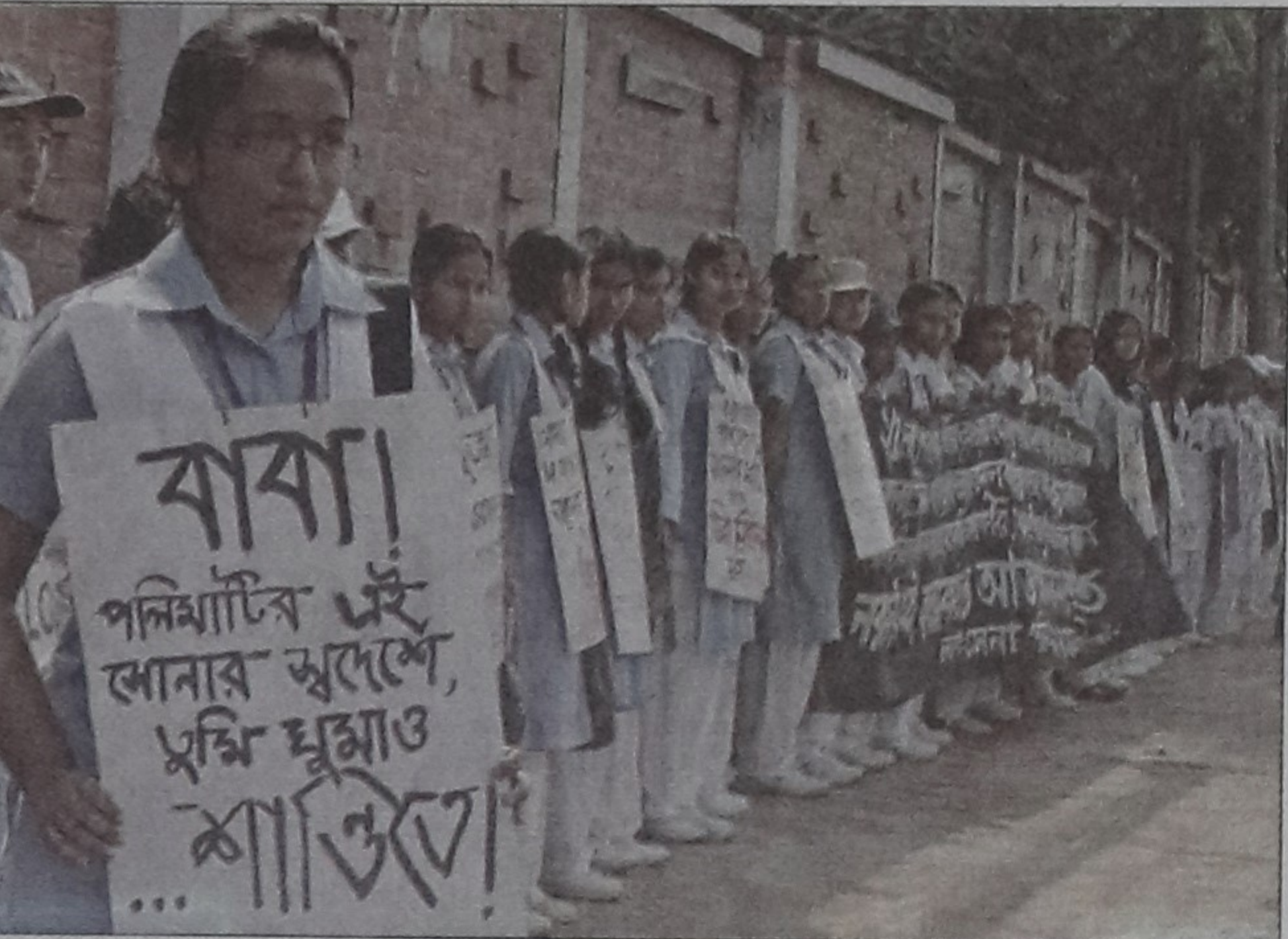
Family members of slain army officers form a human chain at Dhaka Cantonment Jahangir Gate yesterday demanding a fair probe into the massacre. A bereaved family, below, offer feteha at the graves of officers in the Army Graveyard at Banani.